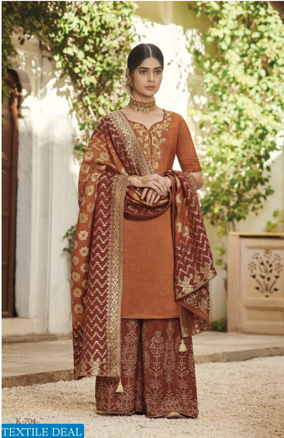
K-704 TEXTILE DEAL