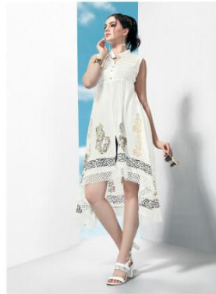
D.NO : 1007