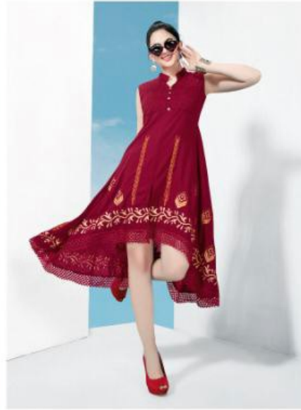
D.NO : 1002