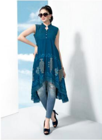
D.NO : 1001