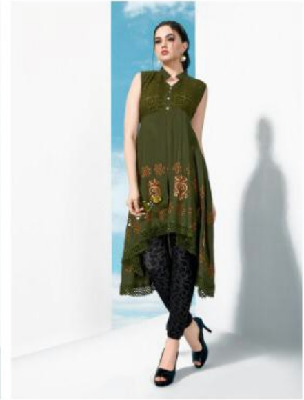
D.NO : 1004