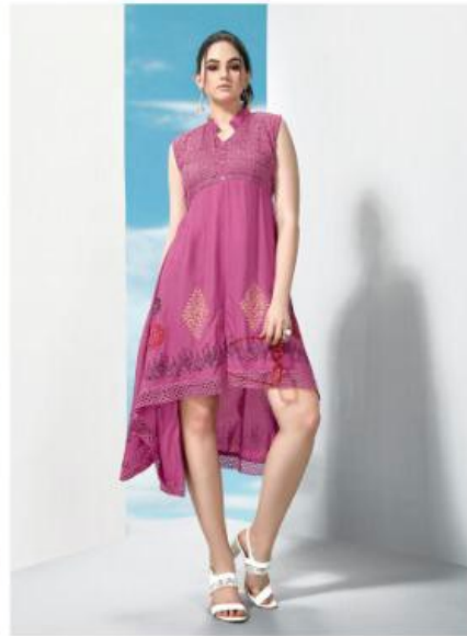
D.NO : 1006