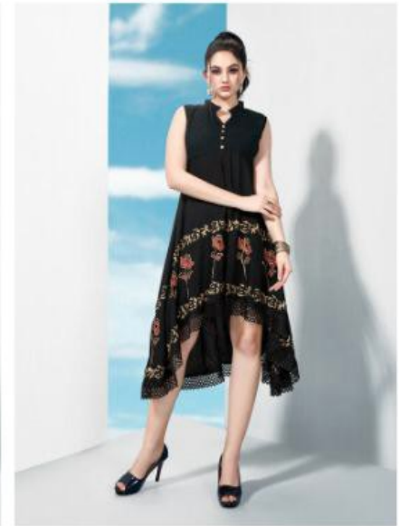
D.NO : 1008