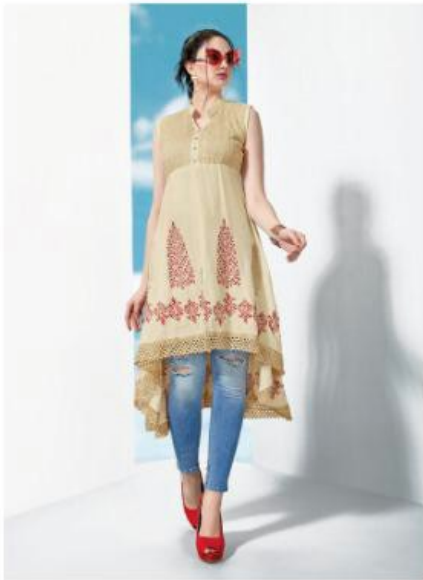
D.NO : 1005