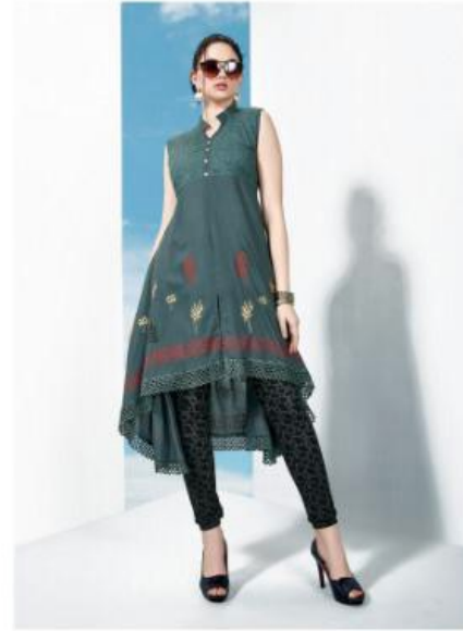
D.NO : 1003