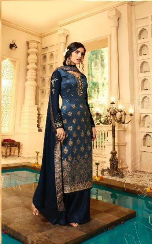
"Stunning Embellishments" The design is a tribute to the rich heritage of Indian fashion and the art of embroidery. The intricate patterns and motifs are a true work of art.