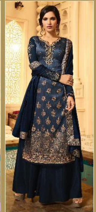
▲ 16306 ▲