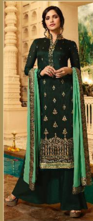
▲ 16304 ▲