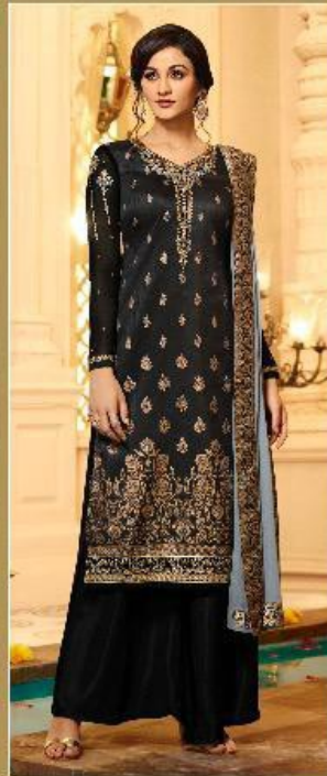
▲ 16303 ▲