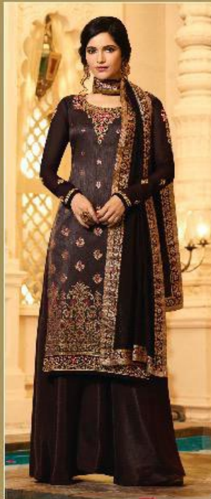
▲ 16302 ▲