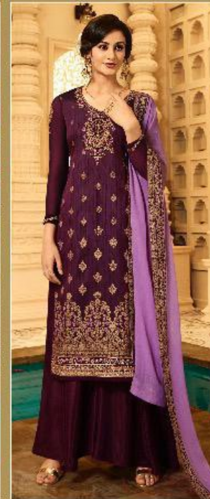
▲ 16305 ▲