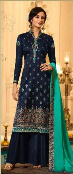
▲ 16301 ▲