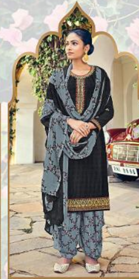
Style No. 9205