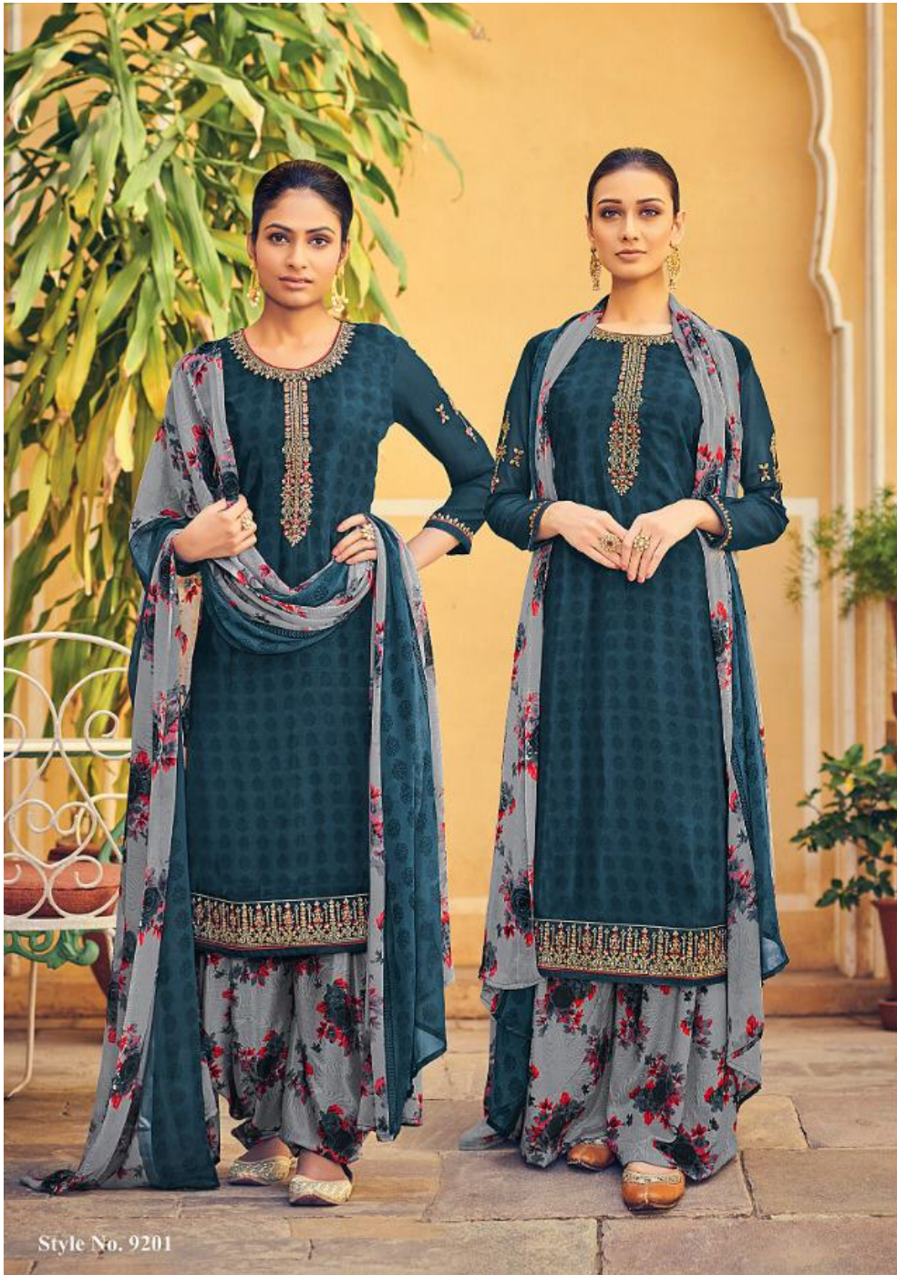
Style No. 9201