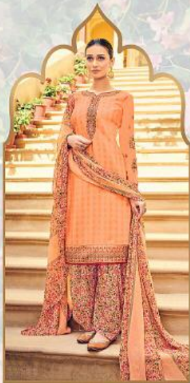
Style No. 9208