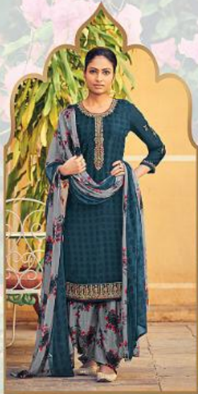
Style No. 9201