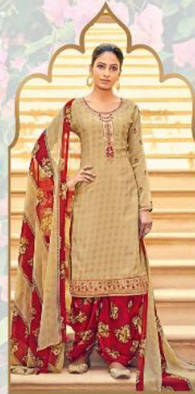
Style No. 9204