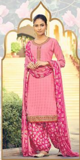
Style No. 9202