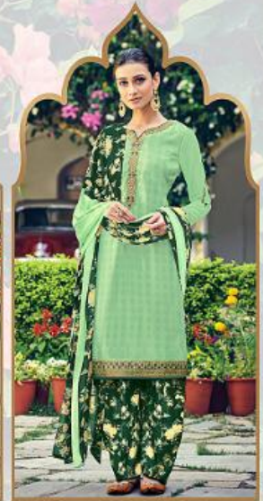
Style No. 9206