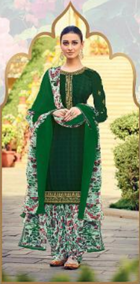
Style No. 9203