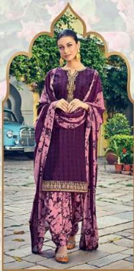
Style No. 9207