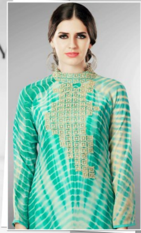
Zari neck design patch will change as per size