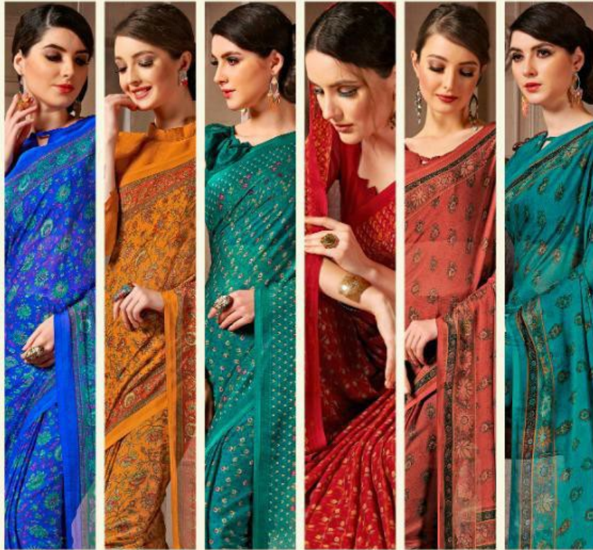
5301a 5301b 5302a 5302b 5303a 5303b