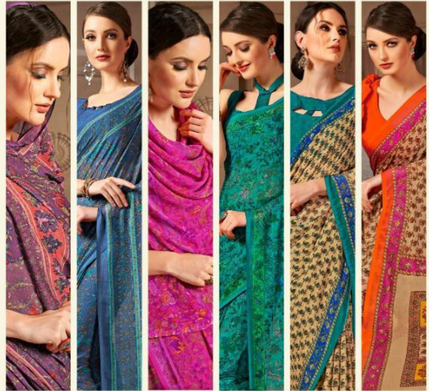
5304a 5304b 5305a 5305b 5306a 5306b