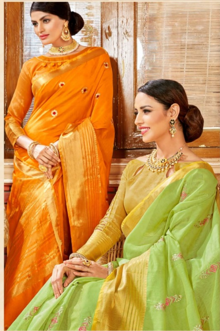
The classic south Indian stripes are given a magic touch with a dash of contemporariness. Wear in on an evening affair with sian twisted your fingertips.