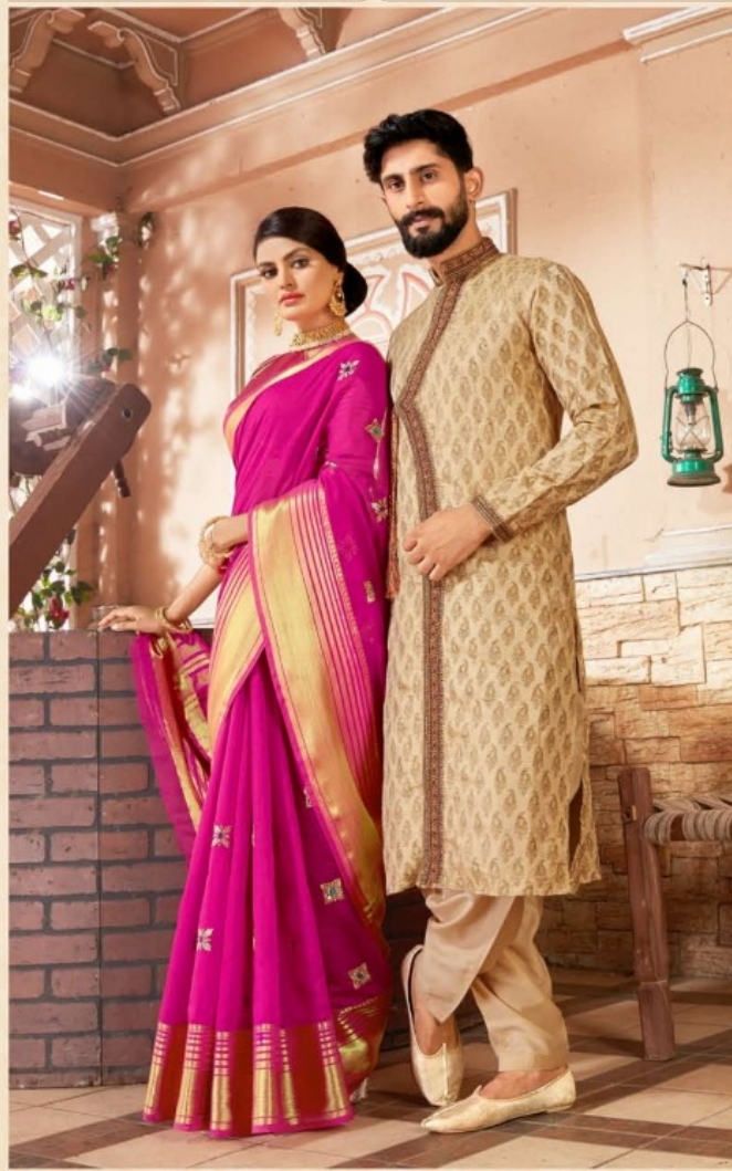
Bright red with blue combination a very lucive merge including different shades, contemporary yoke design with chevron border to edge a perfect design for any occasion any time.