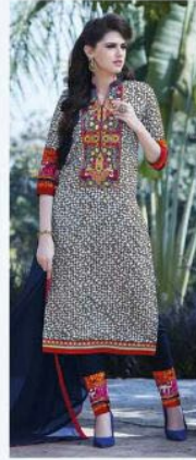
STYLE NO. 322