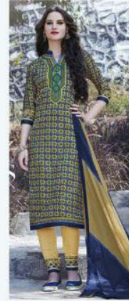
STYLE NO. 324