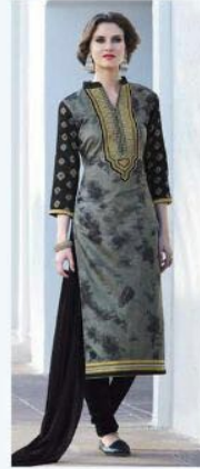
STYLE NO. 323