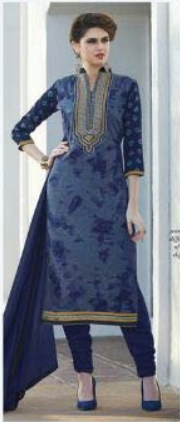
STYLE NO. 328