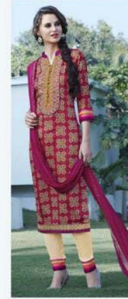
STYLE NO. 325