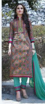
STYLE NO. 321