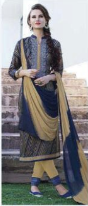
STYLE NO. 320