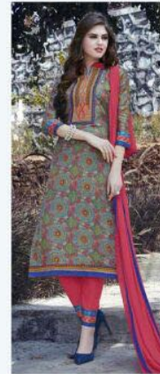
STYLE NO. 332