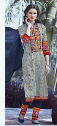
STYLE NO. 326