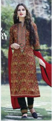
STYLE NO. 319