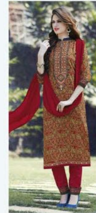
STYLE NO. 334