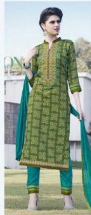
STYLE NO. 330