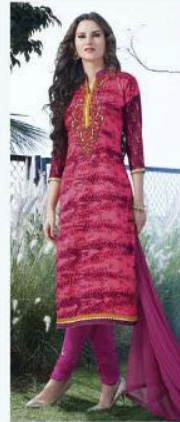
STYLE NO. 331