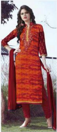
STYLE NO. 327