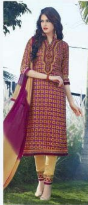
STYLE NO. 329