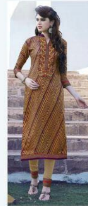
STYLE NO. 333