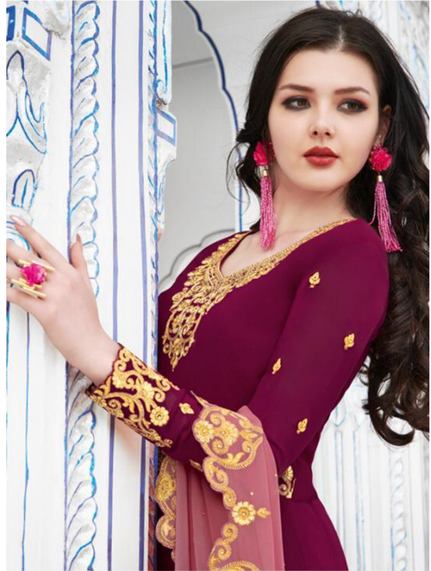
Shining net gown with contrast embroidery and sequins. Striking embroidered gown embellished with antique cutwork detailing on delicate netting. Your bridal number isn't just for looking good, it's a piece of memory that you carry forward in your new life.