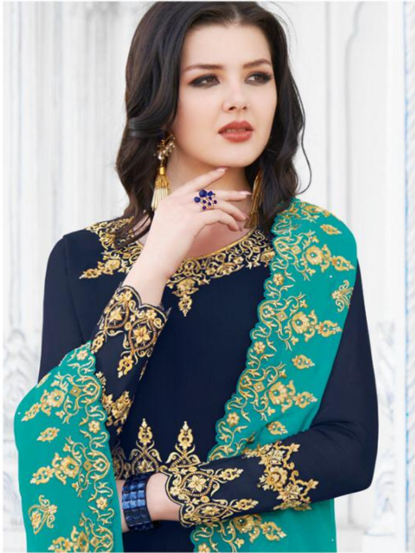
Some women are born to claim the universe as their own. Their shimmer is heavenly, and their gait graceful. Their dresses, when discarded, are considered pieces of art and displayed in museums for generations to come.