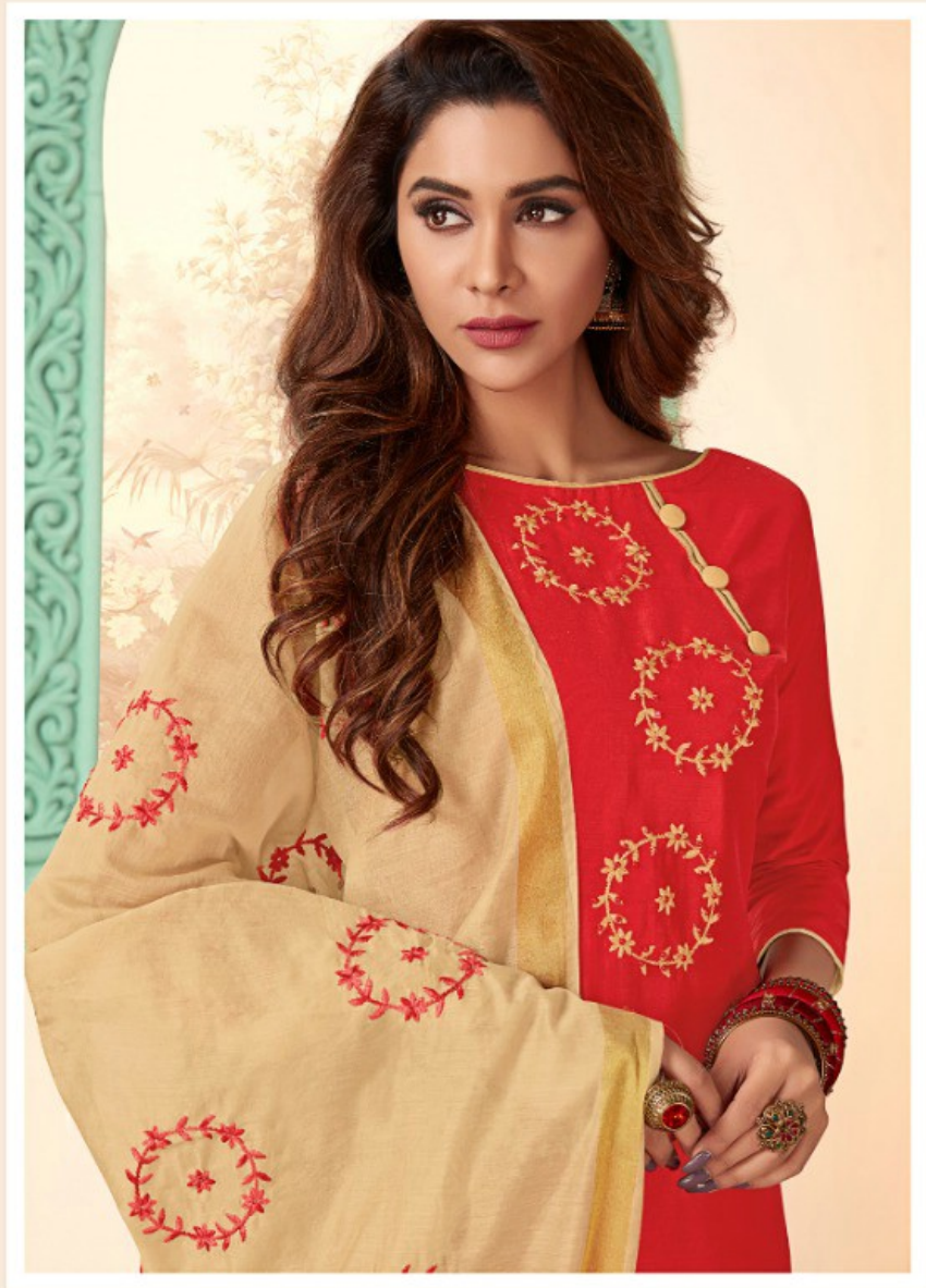
❖ D.2009 ❖

Fashion is what you're offered four times a year by designers. And style is what you choose