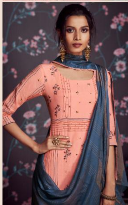
An elegant re-interpretation of fashions classic designs.