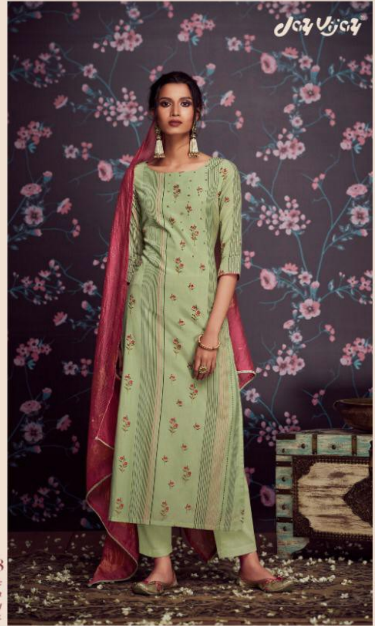
1988 Elegance & sophistication create a charming symphony.