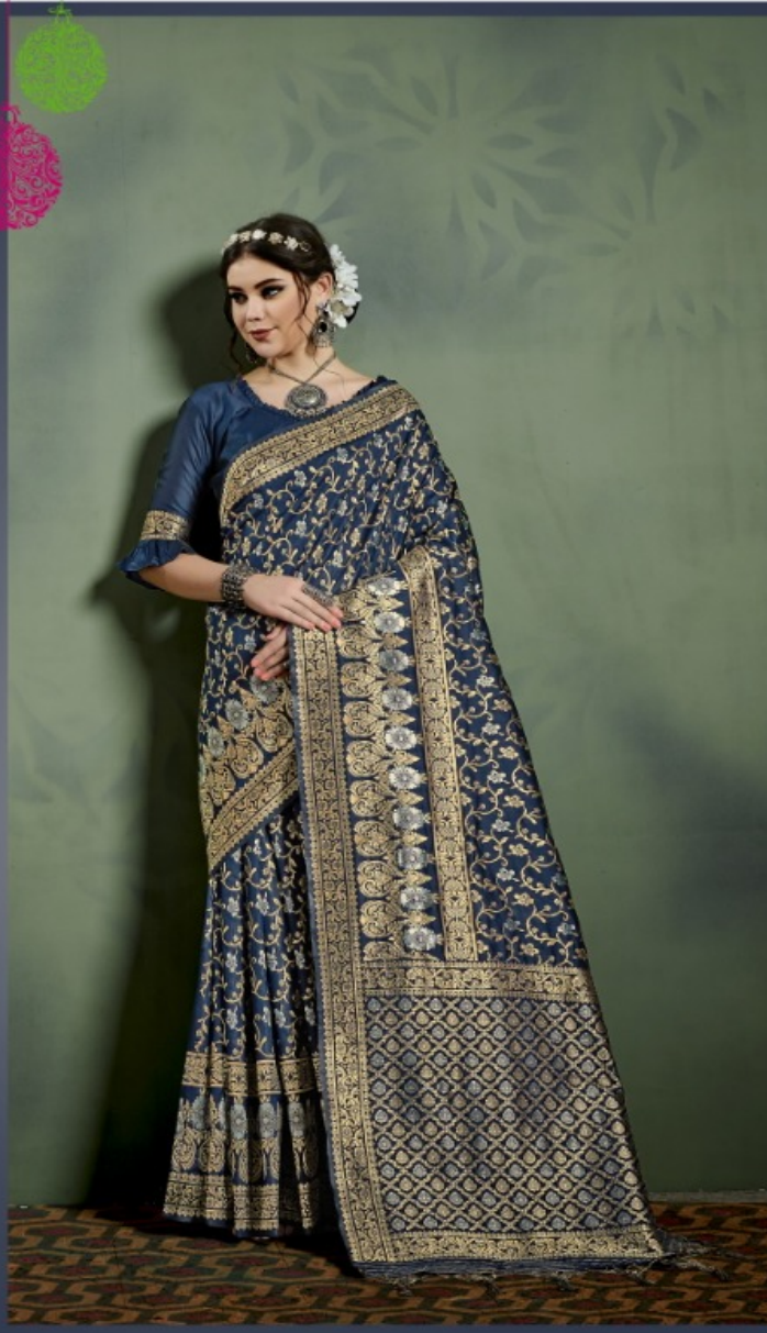
Sarees is reflection of indian culture and regional flavour. live on the edge with indian design & glamour