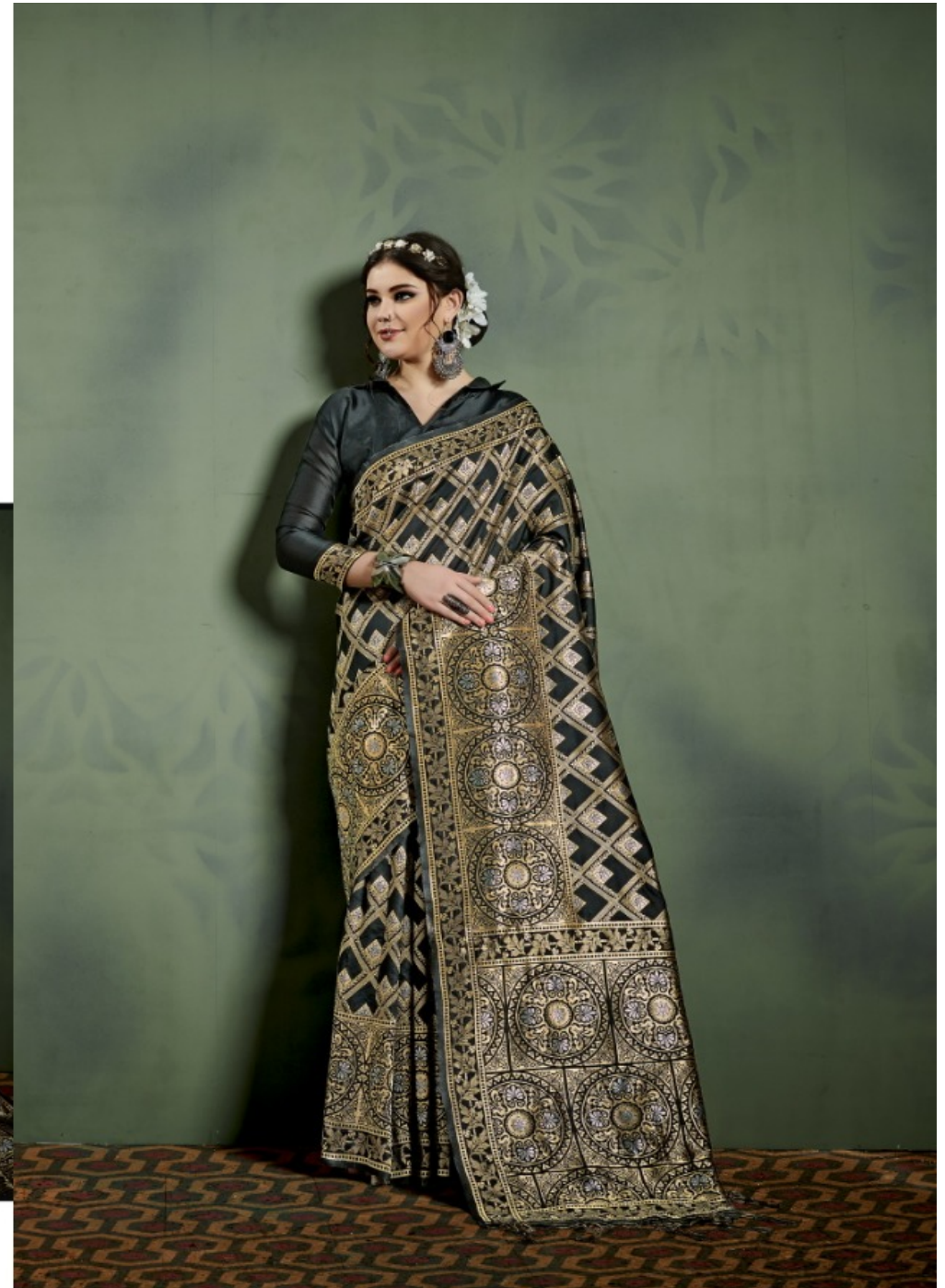
Sarees is REFLECTION of indian culture and regional flavour, live on the edge with Indian design & Glamour