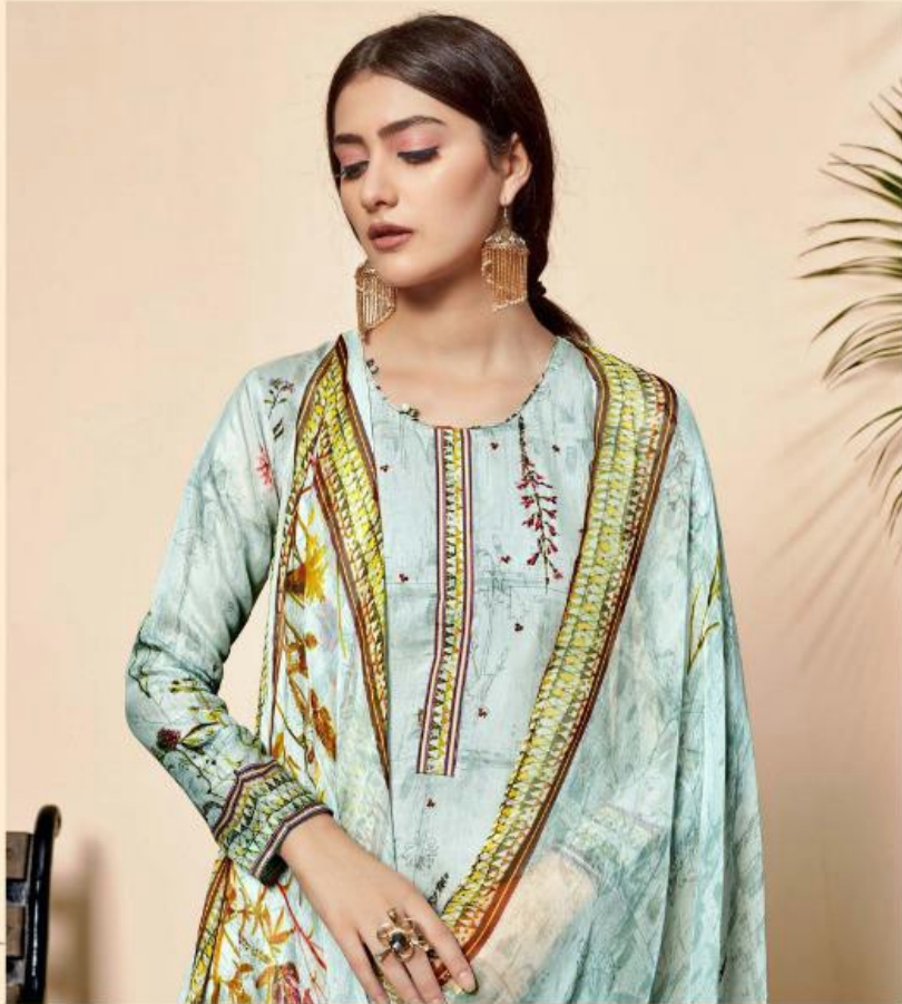
STYLE - 2001