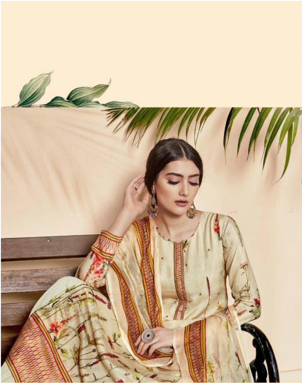
STYLE - 2004