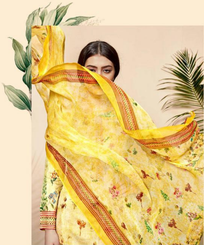
STYLE - 2003