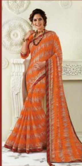
5825 - FORUM