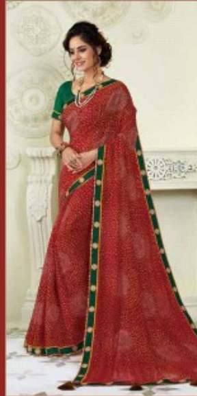
5826 - PARINAAZ