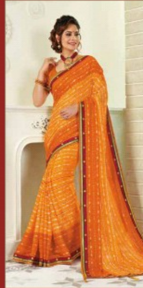
5829 - FORUM