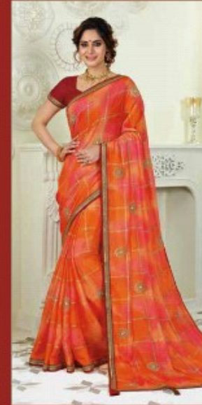
5830 - PARINAAZ