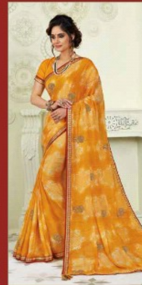
5832 - LADLEE