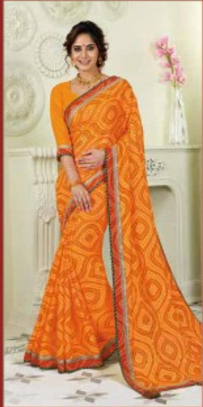
5824 - PARINAAZ