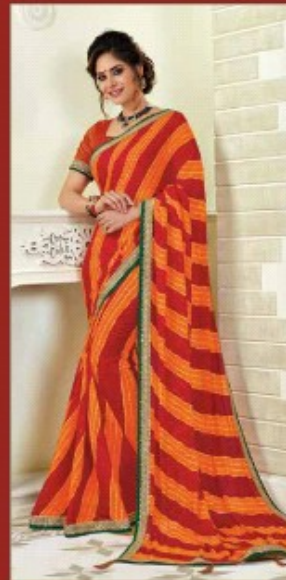
5831 - PARINAAZ