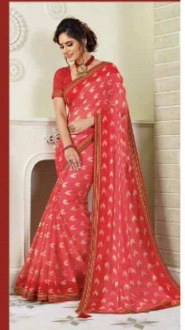
5833 - FORUM