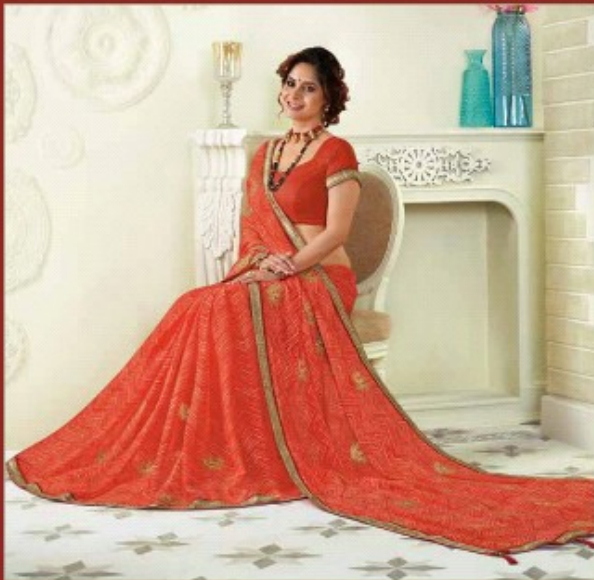
5828 - LADLEE