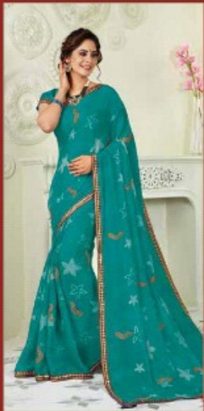
5827 - LADLEE