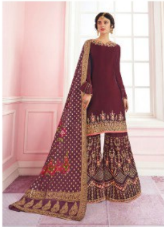
* 8003 *