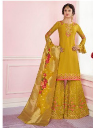
* 8004 *