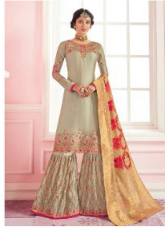
* 8002 *