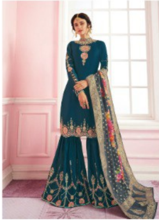
* 8001 *