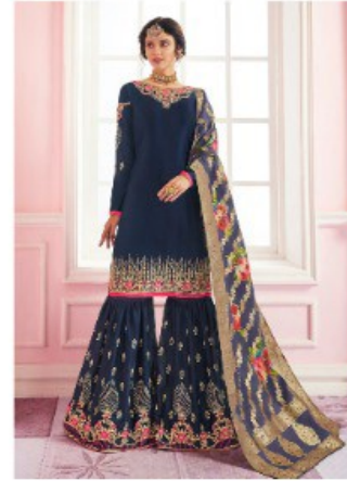
* 8005 *