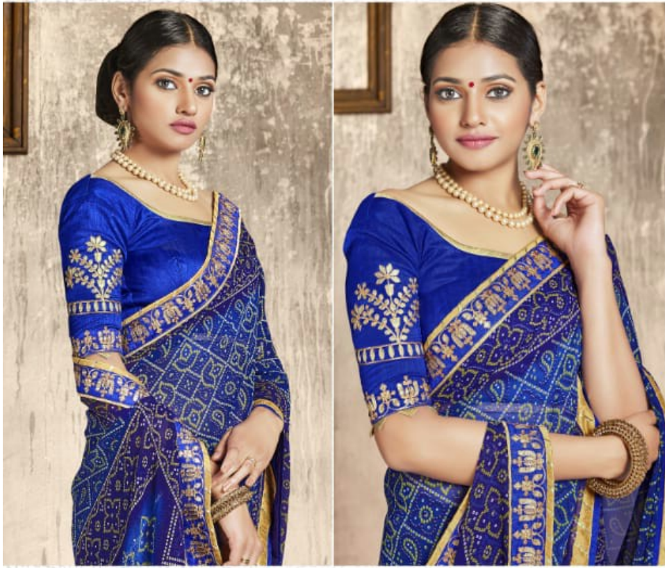
Fashion is a mirror, reflecting the culture.