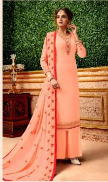
❖ 362 ❖