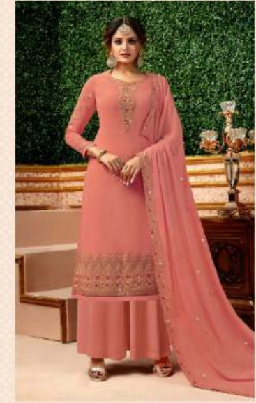
❖ 364 ❖