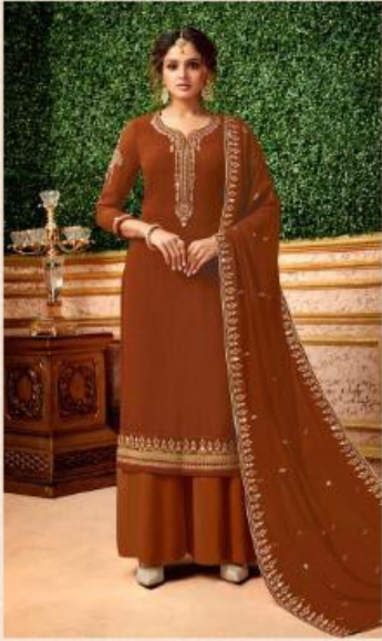
❖ 361 ❖