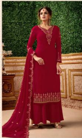
❖ 366 ❖