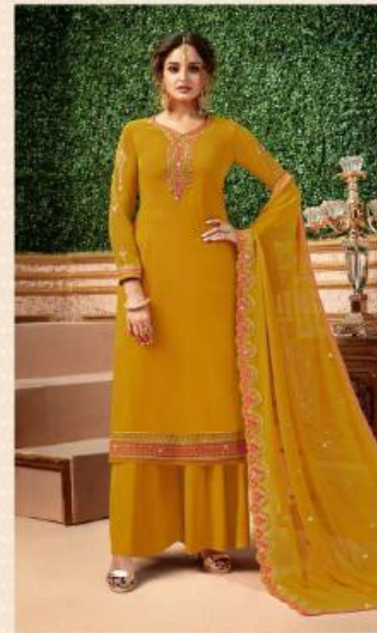
❖ 367 ❖