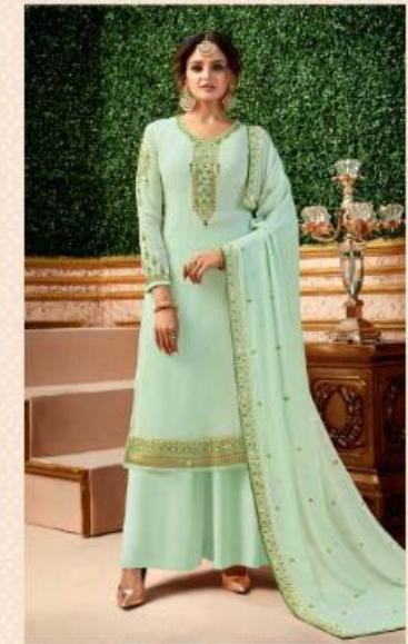
❖ 368 ❖