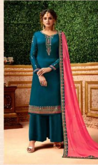
❖ 363 ❖