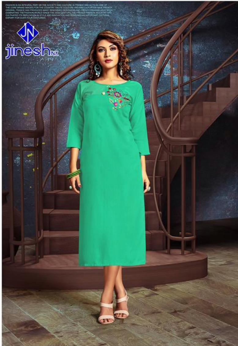
D.NO. - 1006