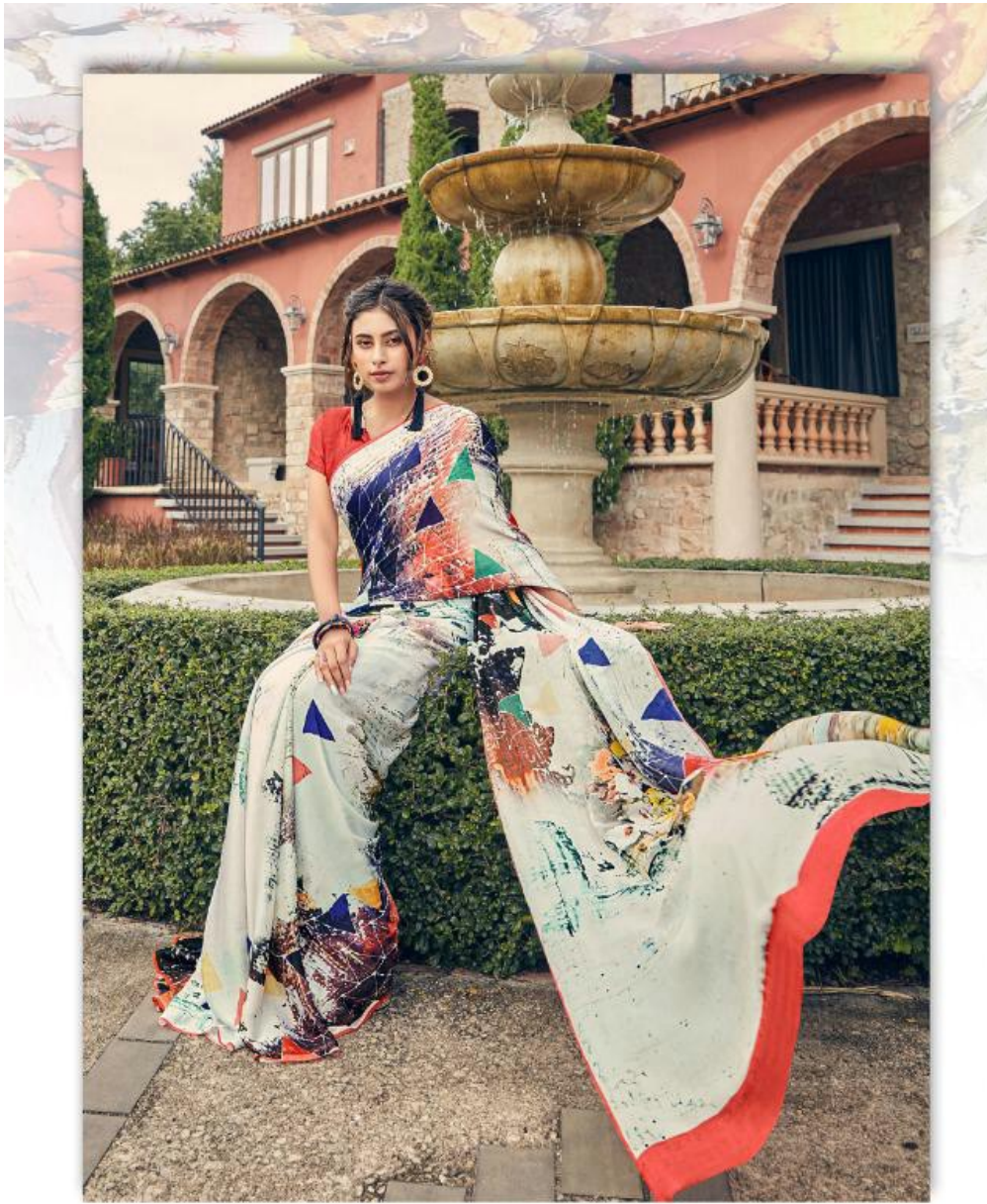
When an Indian girl wears a saree, the world stops to admire her grace!