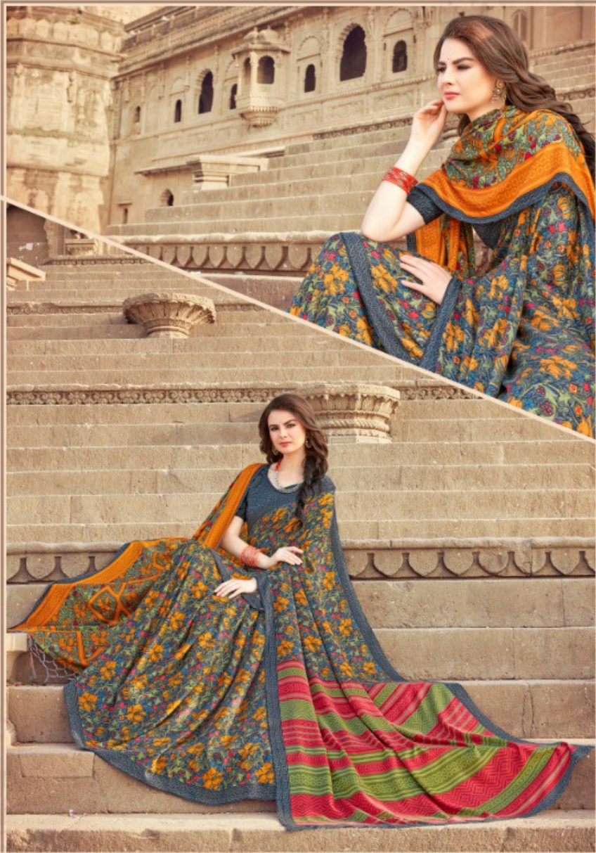
Wrapper in an intense yellow the saree is adorned by a traditional kalamkari block print The bright colour combination only adds the beauty of the piece.