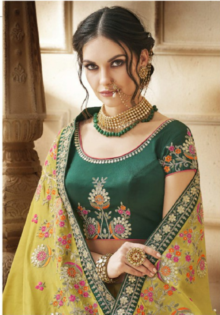
MEHENDI YELLOW HANDLOOM SILK SAREE HAVING GOTA WORK WITH BOTTLE GREEN BORDER AND BLOUSE