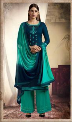
D No 10071