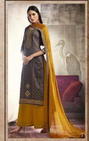
D No 10078