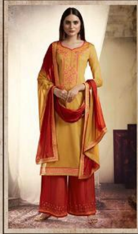
D No 10072