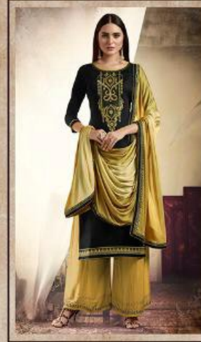
D No 10075