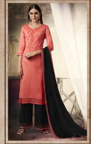
D No 10076