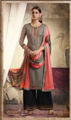
D No 10073