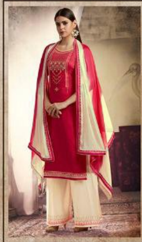
D No 10074