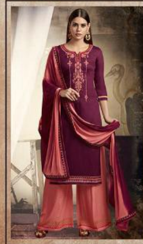
D No 10077