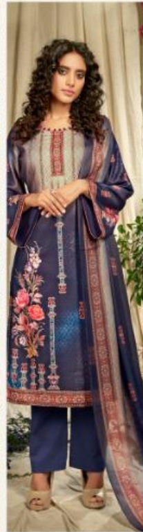
| 878 |