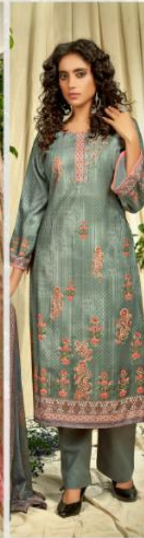
| 881 |