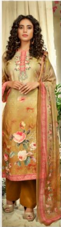
| 876 |