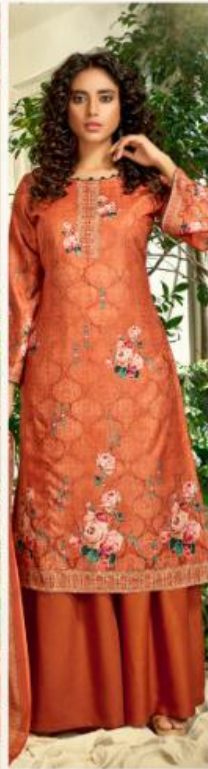
| 877 |