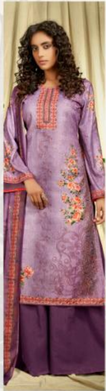
| 875 |