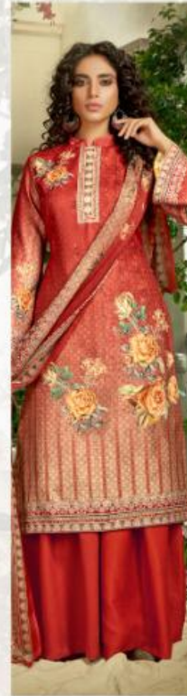
| 879 |