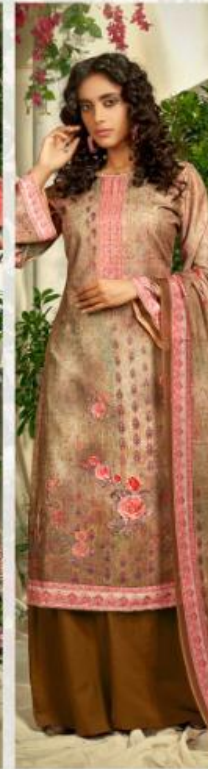
| 880 |