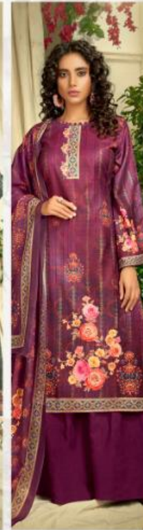
| 882 |