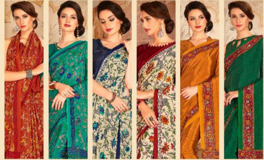
7102a 7102b 7103a 7103b 7104a 7104b