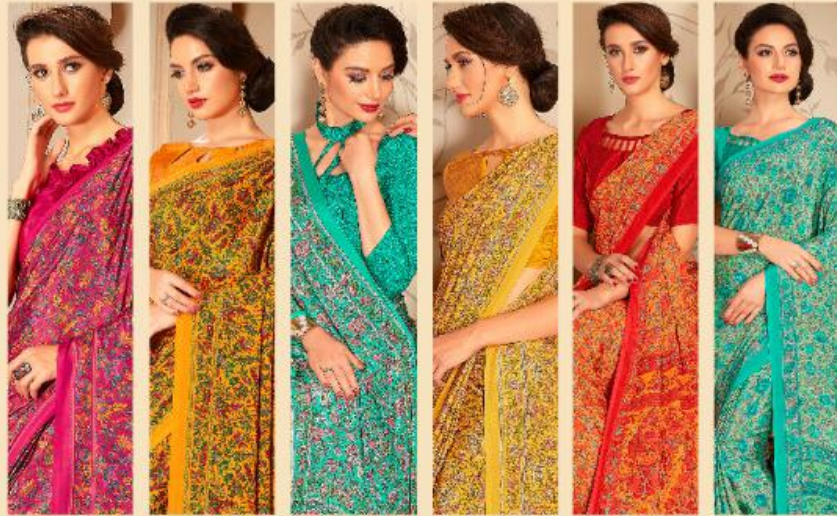
7105a 7105b 7106a 7106b 7107a 7107b