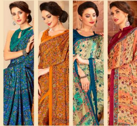
7108a 7108b 7109a 7109b