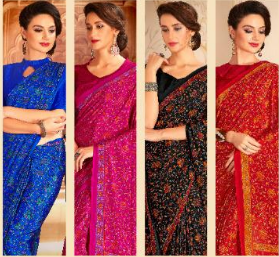
7101a 7101b 7101c 7101d