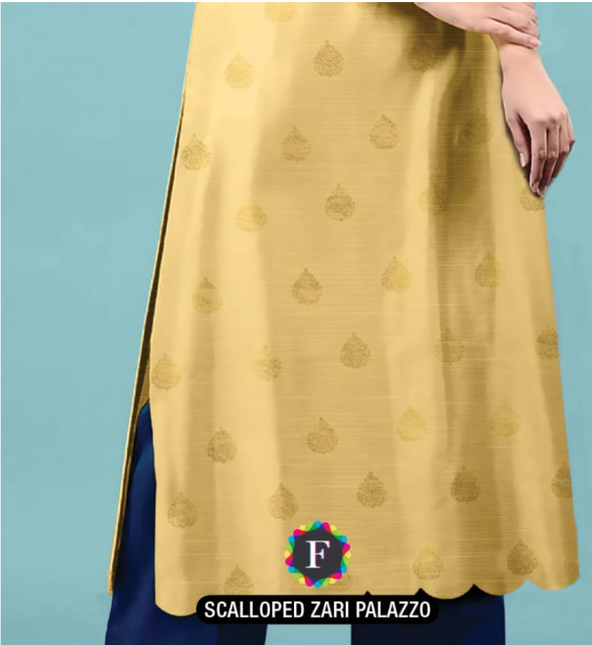
SCALLOPED ZARI PALAZZO