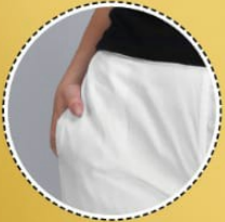
One Side Pocket