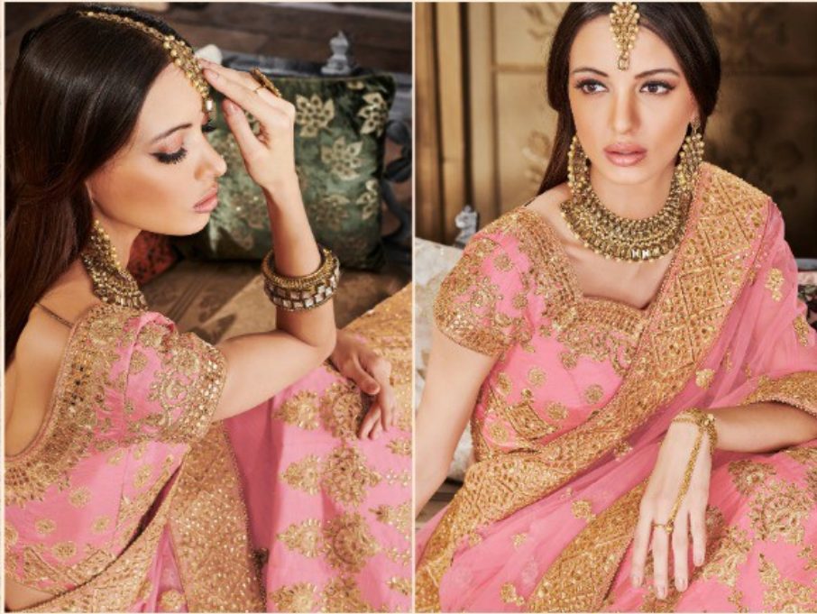
Peach Lehenga in Handloom fabric with Jari working. Blouse in matching fabric and pallu in matching mono net fabric.