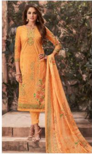
❁ 1771 ❁