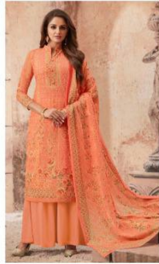
❁ 1772 ❁