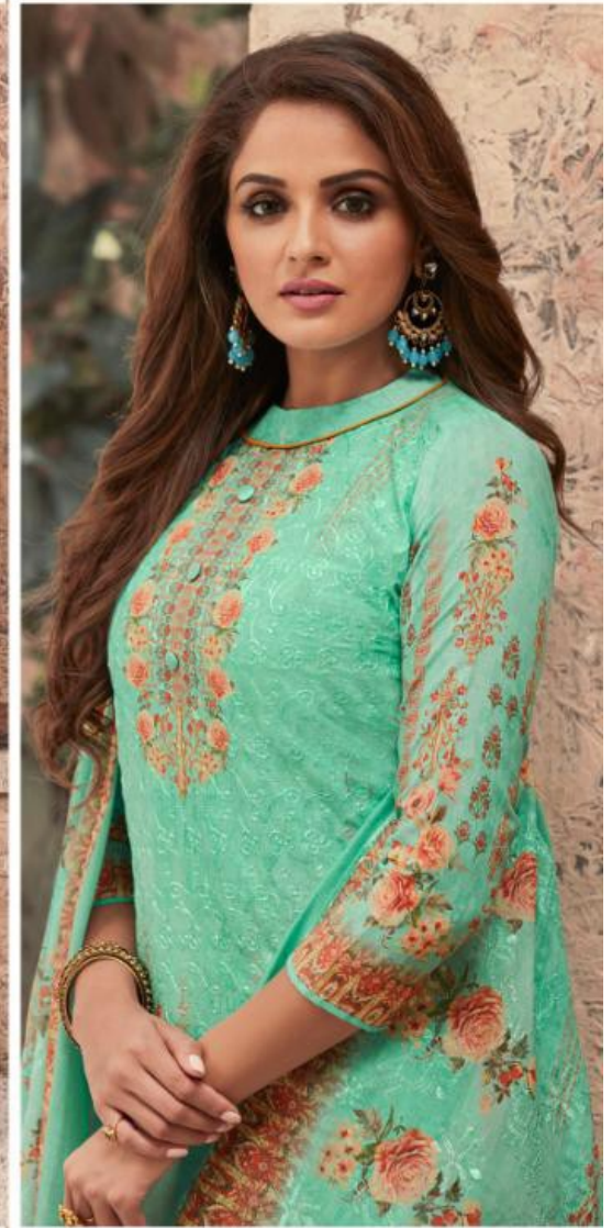
BRIGHT COLOUR IS ONE OF THE STRONGEST FASHION STATEMENT OF THE SEASON AND BOLD DESIGNS.