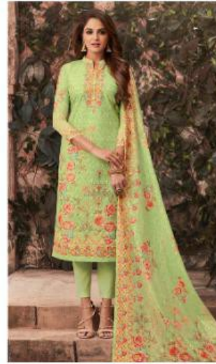
❁ 1773 ❁