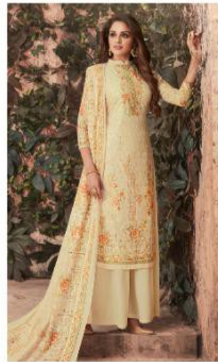
❁ 1776 ❁