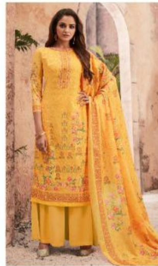
❁ 1777 ❁