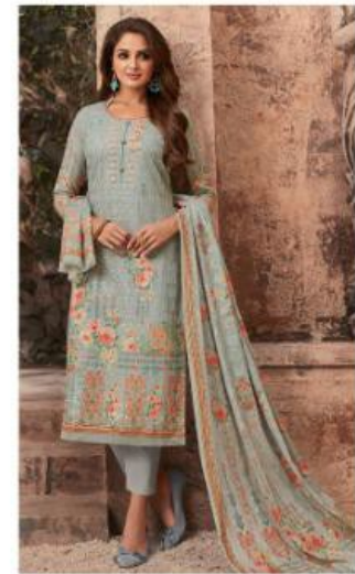
❁ 1778 ❁