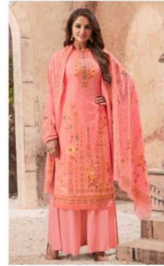
❁ 1774 ❁