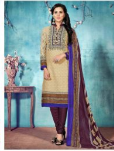
— 1010 —