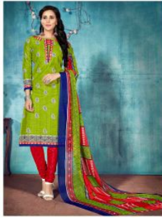
— 1009 —