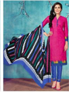
— 1011 —