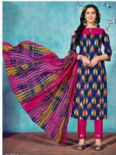
— 1017 —