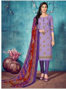
— 1013 —