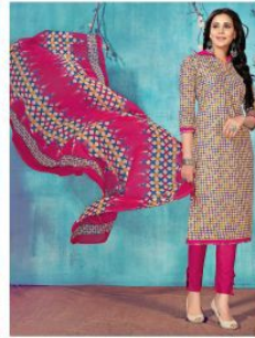
— 1014 —