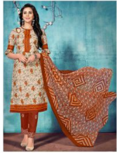
— 1008 —