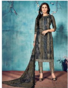
— 1016 —

KHANAK (Chiffon, Dugatta) A Product of GANESHA