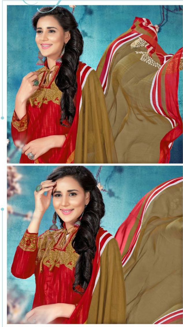
A desire might be felt by its enduring and enchanting expressions. A desire with expressions captivates many eyes