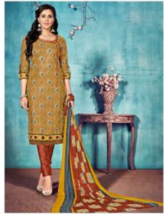
— 1012 —