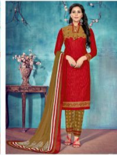
— 1015 —

KHANAK (Chiffon, Dugatta) A Product of GANESHA