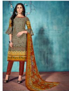
— 1018 —