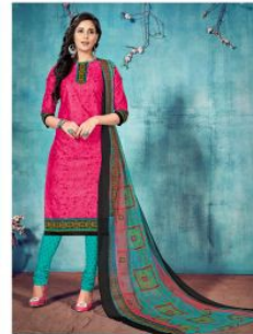
— 1019 —