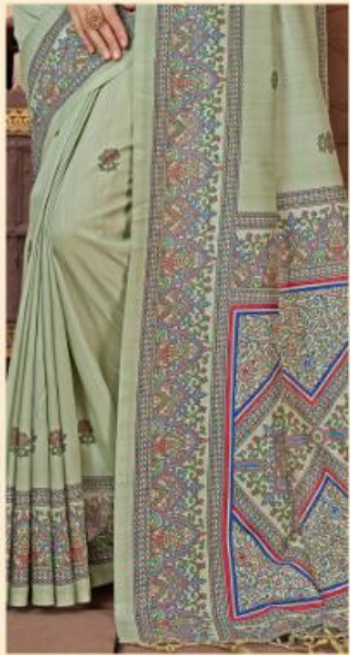
|| 9958 || (DHAPA SILK)