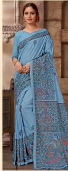
|| 9960 || (DHAPA SILK)