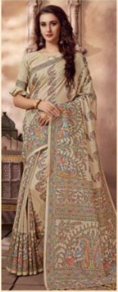
|| 9951 || (DHAPA SILK)