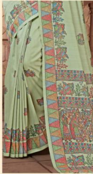
|| 9953 || (DHAPA SILK)