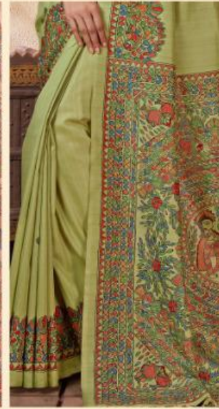
|| 9955 || (DHAPA SILK)