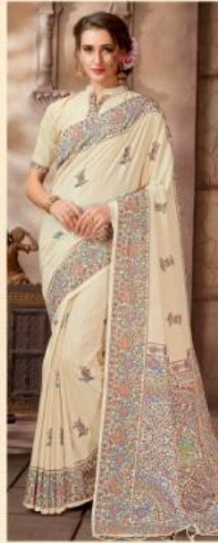
|| 9959 || (DHAPA SILK)