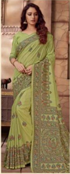
|| 9952 || (DHAPA SILK)