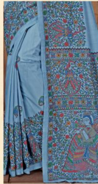
|| 9961 || (DHAPA SILK)