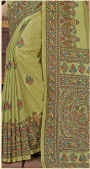
|| 9952 || (DHAPA SILK)