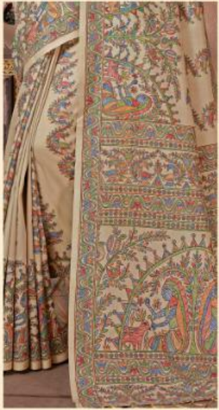
|| 9951 || (DHAPA SILK)