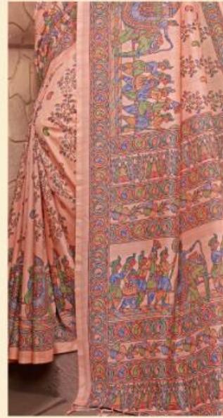
|| 9954 || (DHAPA SILK)