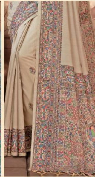
|| 9960 || (DHAPA SILK)