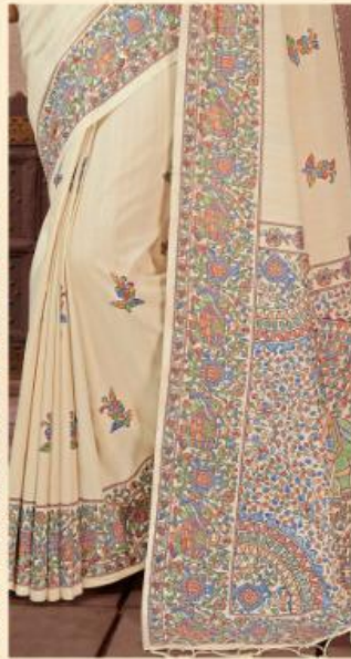
|| 9959 || (DHAPA SILK)