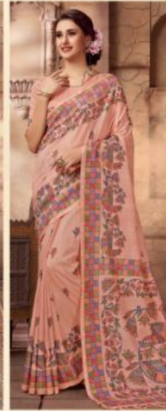
|| 9962 || (DHAPA SILK)