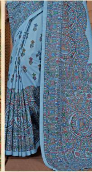
|| 9956 || (DHAPA SILK)