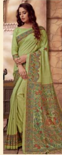
|| 9955 || (DHAPA SILK)