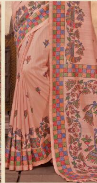
|| 9962 || (DHAPA SILK)