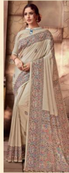
|| 9961 || (DHAPA SILK)