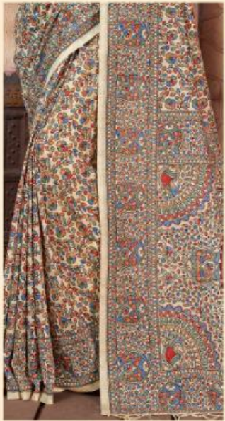
|| 9957 || (DHAPA SILK)