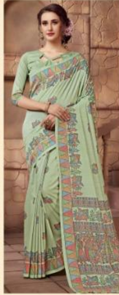
|| 9953 || (DHAPA SILK)