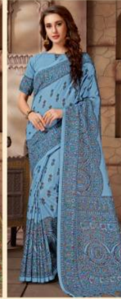
|| 9956 || (DHAPA SILK)