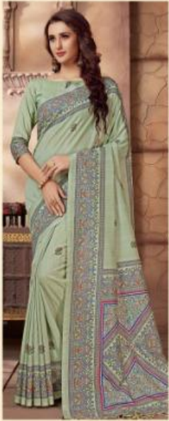
|| 9958 || (DHAPA SILK)