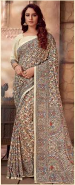
|| 9957 || (DHAPA SILK)