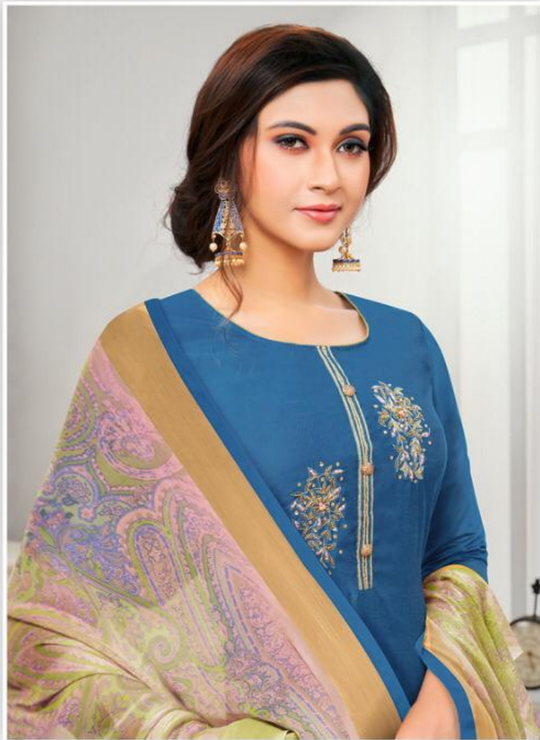
SHADED HANDLOOM SILK DRESS IN RED MULTI COLORS

Top in self embroidered thread with handwork High flight, Bottom in dark Mehandi Sarlocon Dupatta in pista chiffon.