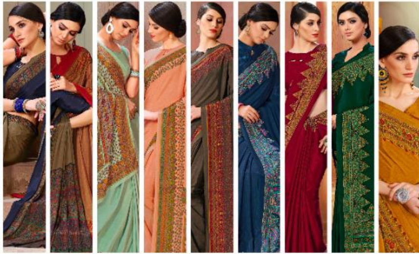
8601A 8601B 8602A 8602B 8602C 8603A 8603B 8603C 8604A