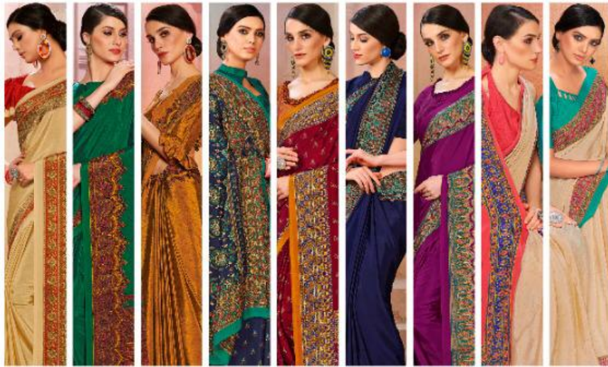
8608B 8609A 8609B 8610A 8610B 8611A 8611B 8612A 8612B