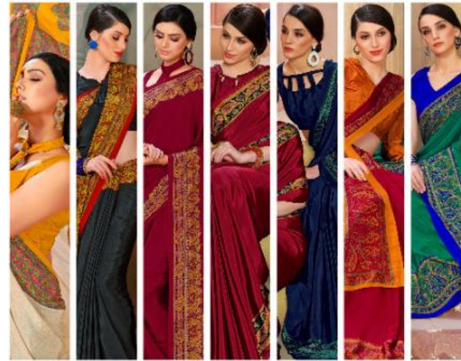
8612C 8613A 8613B 8614A 8614B 8615A 8615B