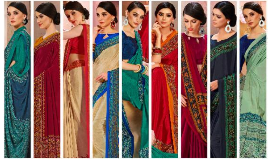
8604B 8604C 8605A 8605B 8606A 8606B 8607A 8607B 8608A