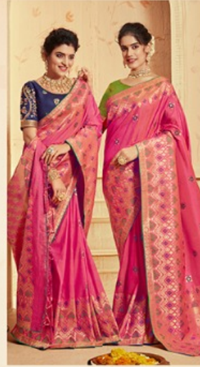
.. 3834 ..