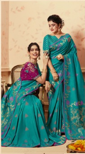
.. 3837 ..