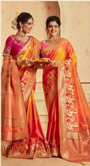
.. 3838 ..