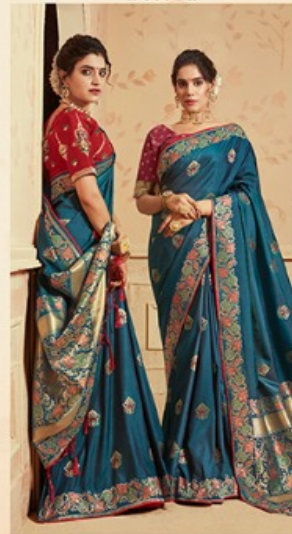
.. 3839 ..