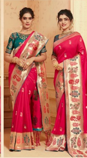
.. 3835 ..