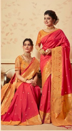
.. 3832 ..