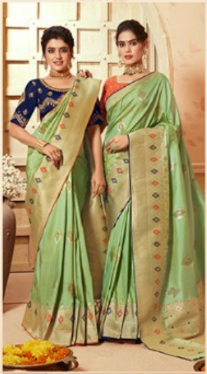
.. 3836 ..