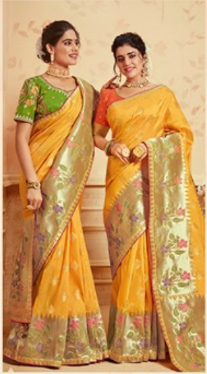
.. 3831 ..