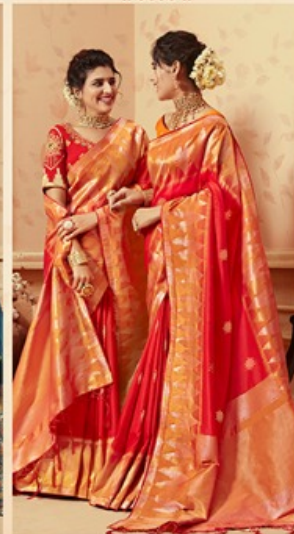
.. 3840 ..