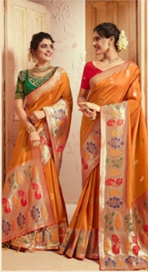
.. 3833 ..