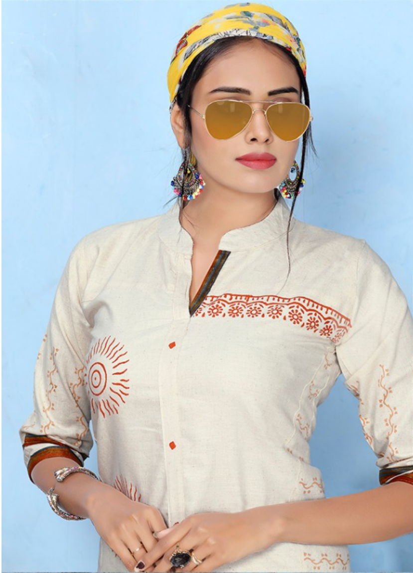
Possession of the precisely Pretisely decorated with to create the extra ordinary artistic piece.