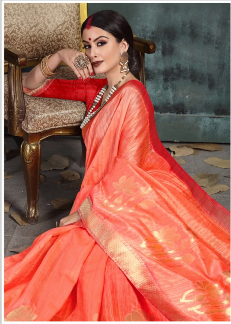
● Traditionally blessed in every ways ●