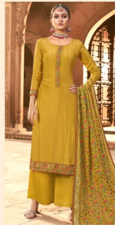
* 1004 *