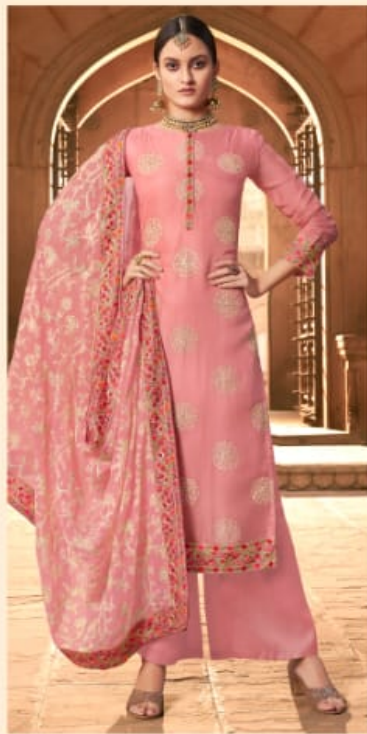
* 1002 *