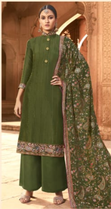
* 1001 *