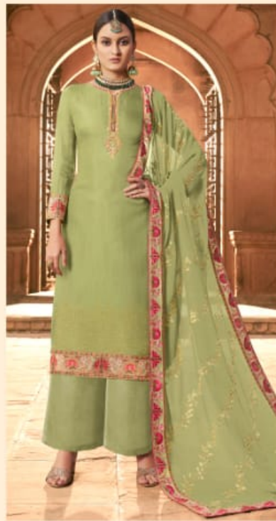
* 1003 *