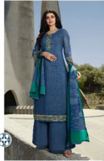
• 12305 •