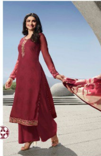
• 12304 •