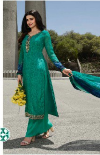
• 12302 •