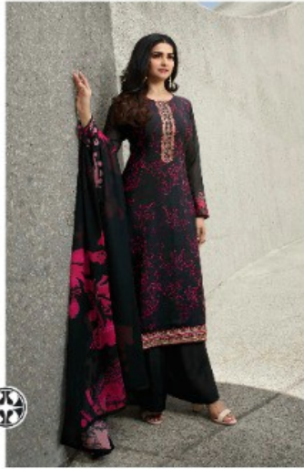
• 12301 •