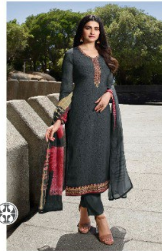
• 12307 •