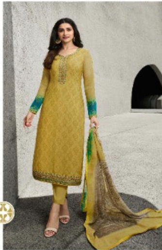
• 12303 •