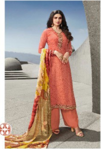
• 12306 •