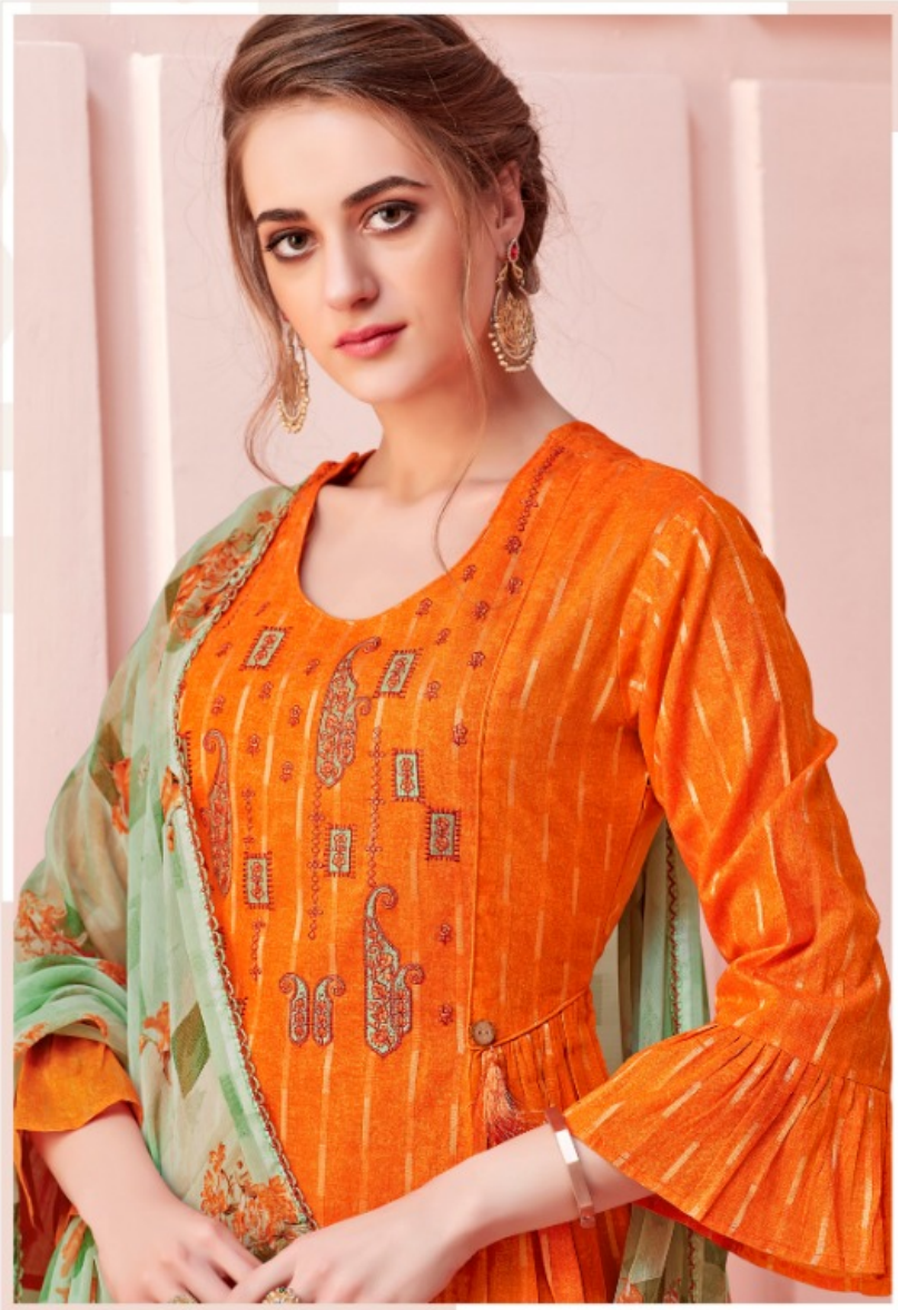
A flow dress with nostalgic detailing takes us back to the pretty girly frocks of our childhood. Statement slides bring it into now