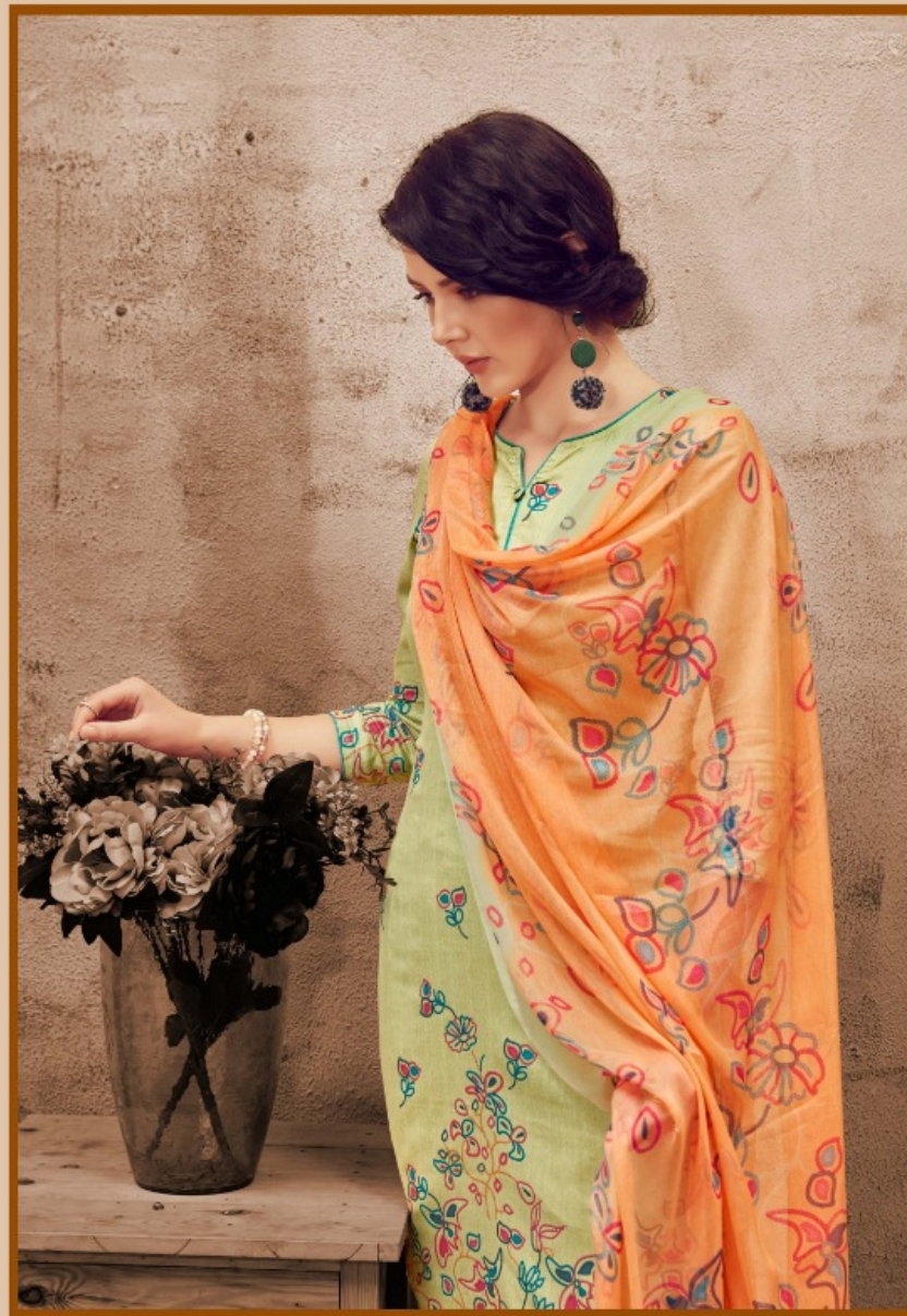
DRESS OF BRING OPULENCE BACK TO YOUR SEASON DRESSING. GIVE A GLAMOROUS TOUCH TO YOUR PERSONALITY WITH A BLEND OF CHARMING HUES.