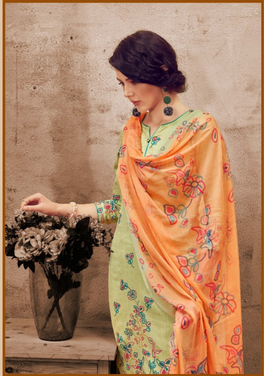
DRESS OF BRING OPULENCE BACK TO YOUR SEASON DRESSING. GIVE A GLAMOROUS TOUCH TO YOUR PERSONALITY WITH A BLEND OF CHARMING HUES.