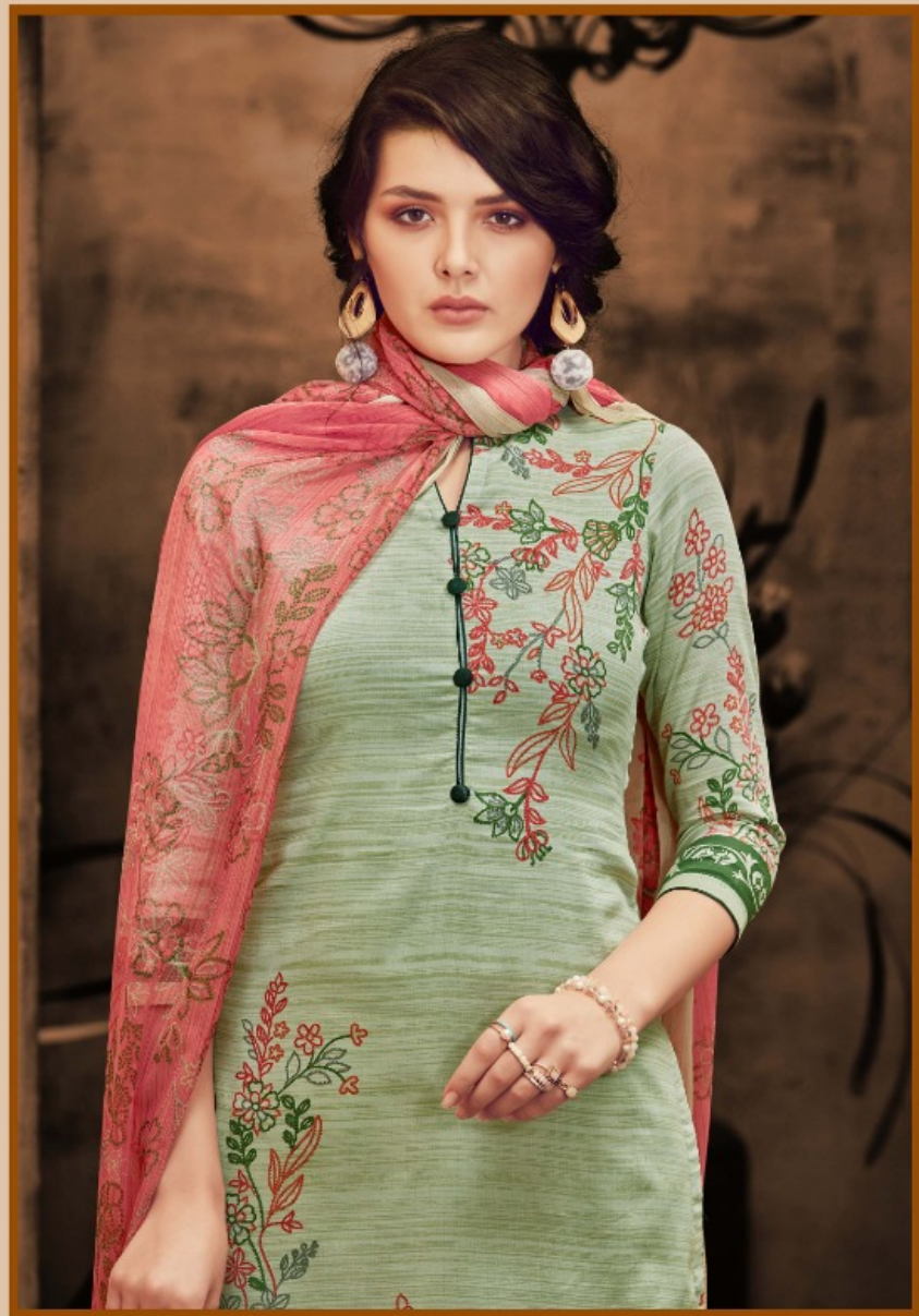
THE COMBINATION OF RED PRINTED DRESS AND DUPATTA ELEVATES YOUR STYLE THIS SEASON.