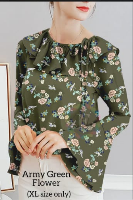
Army Green Flower (XL size only)