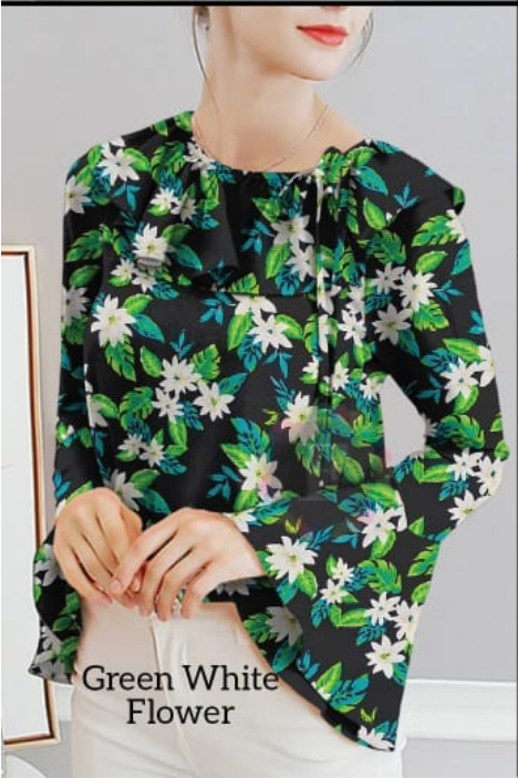
Green White Flower