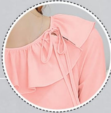
Trumpet Neck with Tie Up Strap