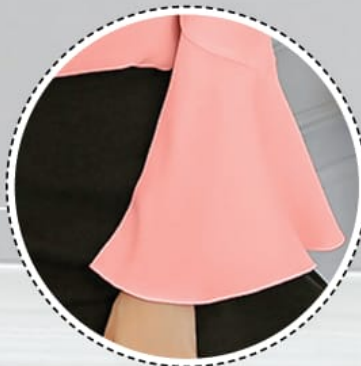
Lotus Leaf Sleeves