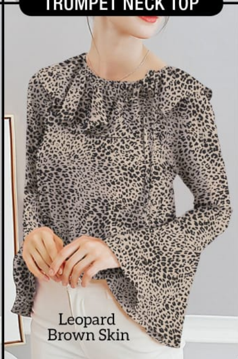
Leopard Brown Skin