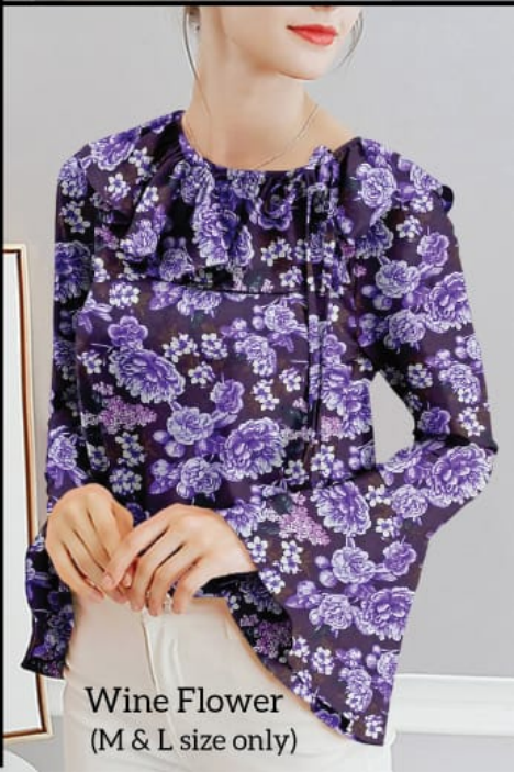
Wine Flower (M & L size only)