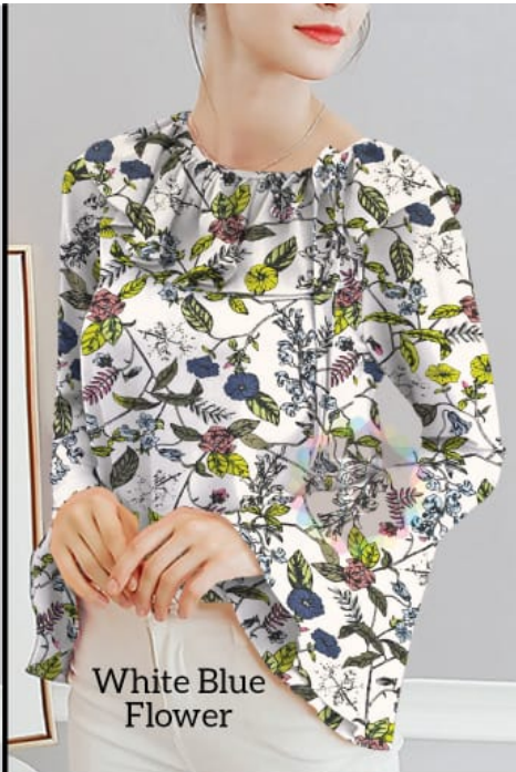
White Blue Flower