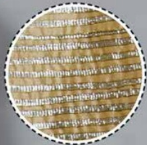
Double Stitched Gota

Size: 34-38 (2XL) • 40-44 (4XL) Length: 38+