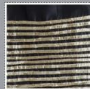
Double Stitched Gota

Fabric: Viscose Silk with 100% Premium Cotton Full Length Inner