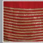
Double Stitched Gota

Fabric: Viscose Silk with 100% Premium Cotton Full Length Inner