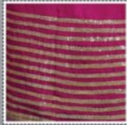
Double Stitched Gota

Fabric: Viscose Silk with 100% Premium Cotton Full Length Inner