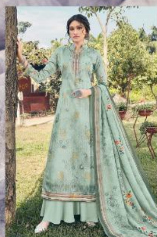
Code # 13807