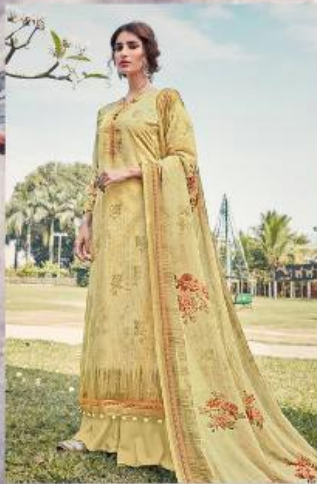
Code # 13805