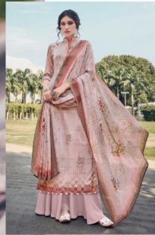
Code # 13804