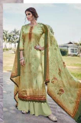
Code # 13808