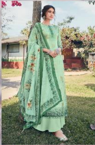
Code # 13801