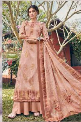
Code # 13802