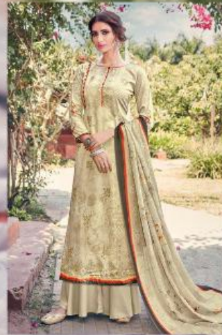
Code # 13803