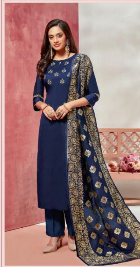
JAZZY ♦ 1003 ♦