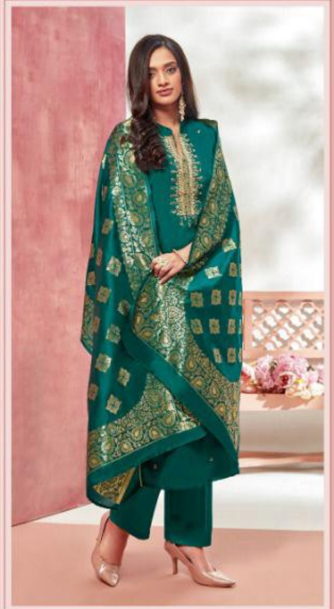
JAZZY ♦ 1004 ♦