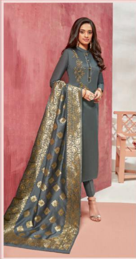
JAZZY ♦ 1002 ♦