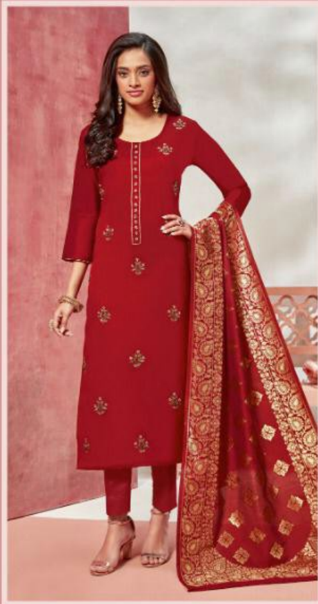
JAZZY ♦ 1001 ♦