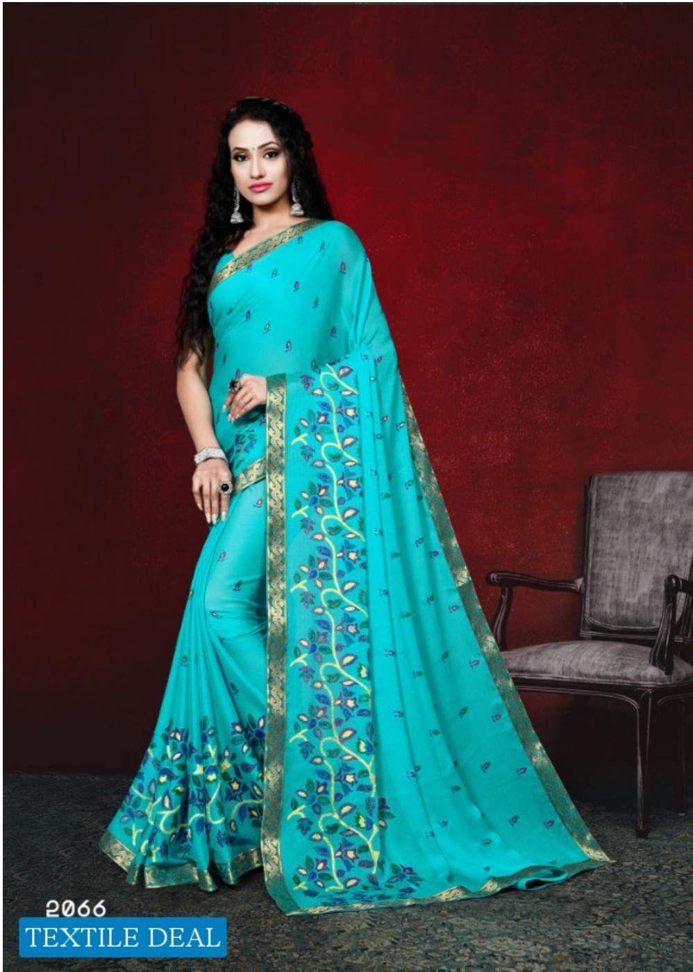
2066 TEXTILE DEAL