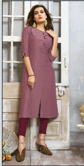
DESIGN NO. 2191