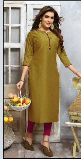
DESIGN NO. 2193