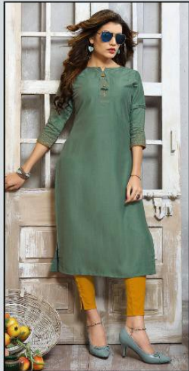
DESIGN NO. 2195