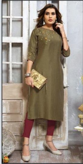
DESIGN NO. 2192