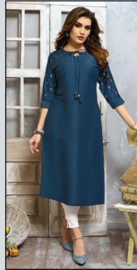
DESIGN NO. 2196