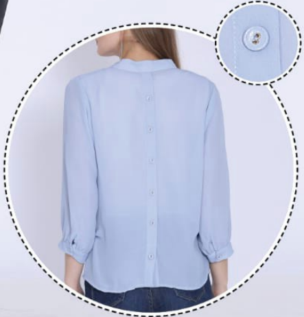
Back with Button

LATEST FASHION • HI-QUALITY • LOWEST PRICE