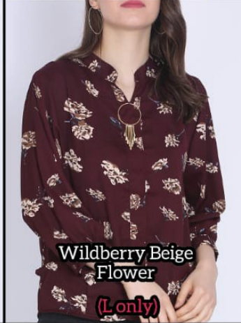
Wildberry Beige Flower (L only)