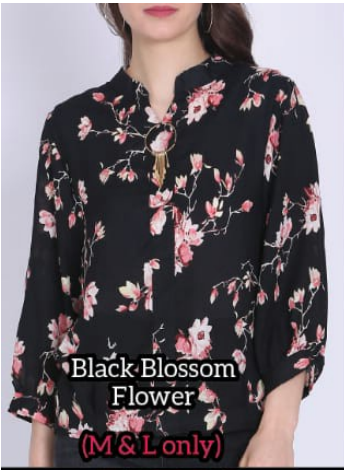
Black Blossom Flower (M & L only)