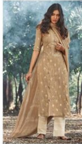
| 5129 |