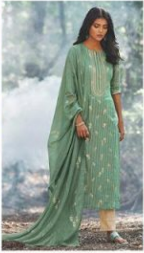
| 5122 |