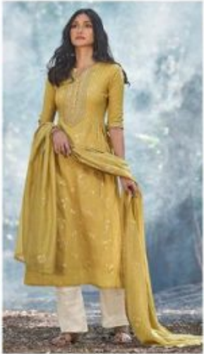
| 5125 |