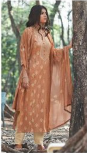
| 5126 |