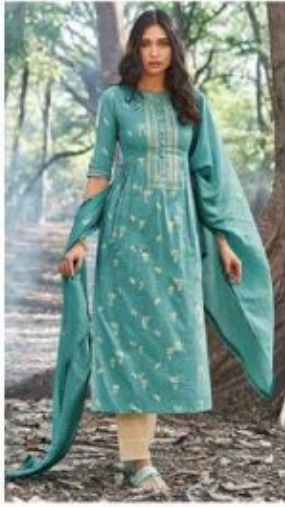
| 5123 |