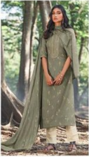
| 5121 |