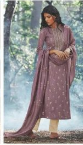
| 5128 |