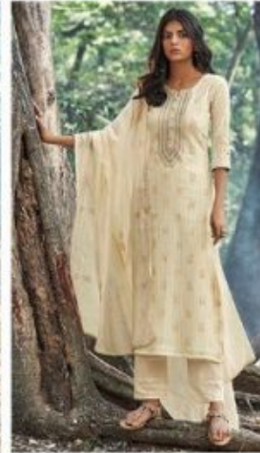
| 5130 |