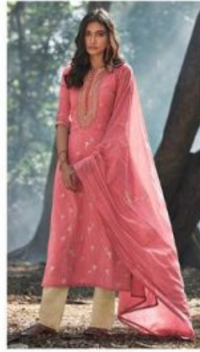
| 5127 |