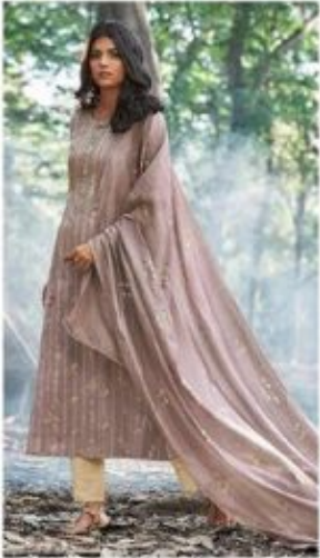
| 5124 |