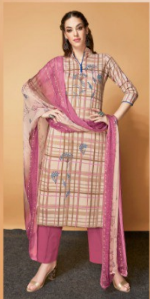
STYLE # 139-006