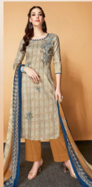
STYLE # 139-008

Adaa Embroidered Pure Jam Silk Collection