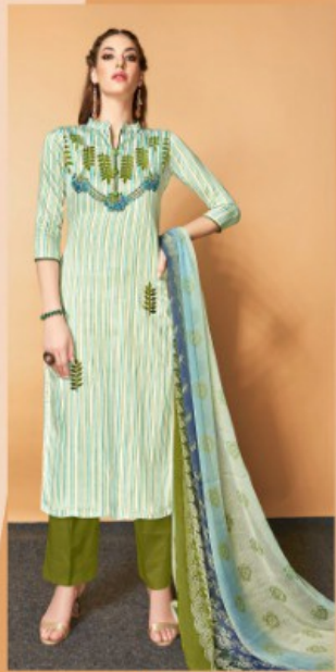
STYLE # 139-001