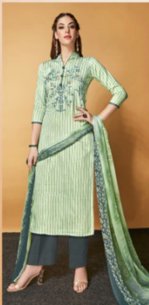
STYLE # 139-007