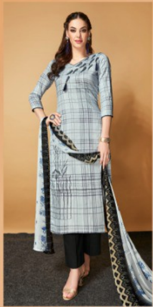
STYLE # 139-002