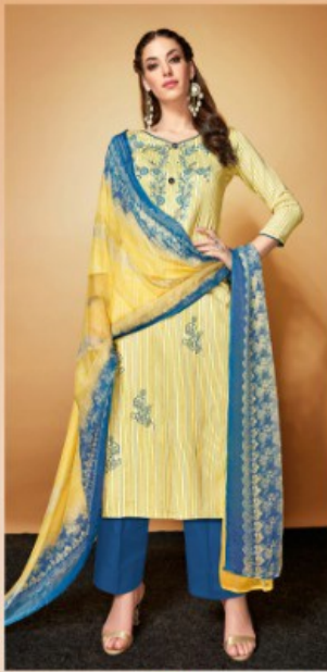
STYLE # 139-003