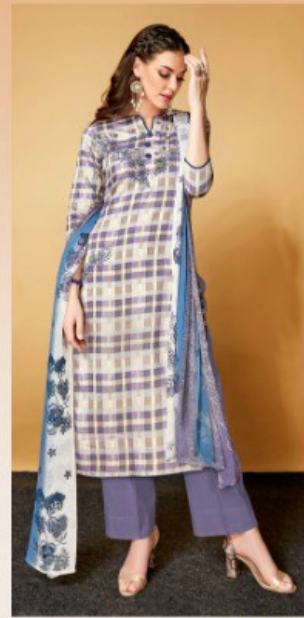
STYLE # 139-004