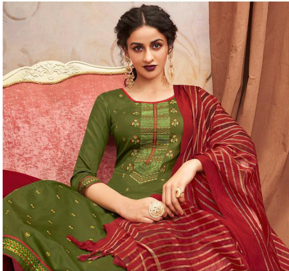
Classic styles with luxurious soft fabrics are highlighted by refined and feminine details.