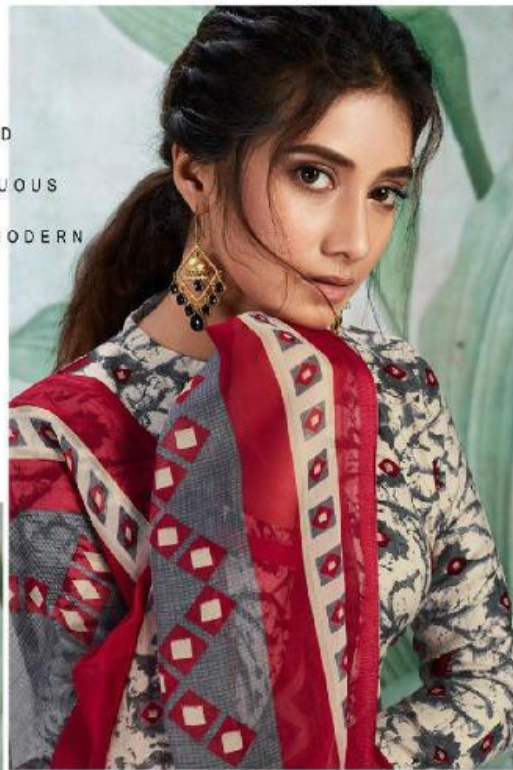
STYLE - 13003

LUXE FABRICS, BOLD PATTERNS & SUMPTUOUS DETAILING ADORN MODERN SILHOUETTES.