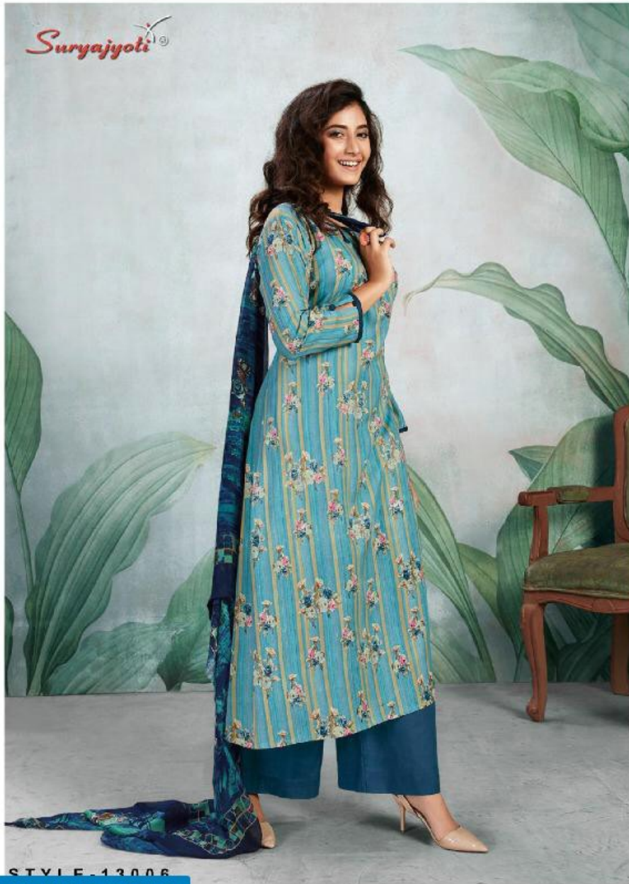
STYLE-13006 TEXTILE DEAL