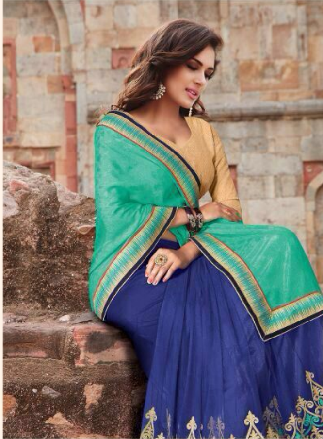
FASHION IS JUST ANOTHER ACCESSORY FOR SOMEONE WITH GREAT STYLE.