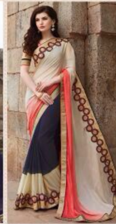
< 4171 >