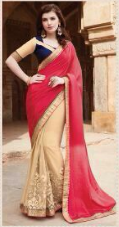
< 4162 >