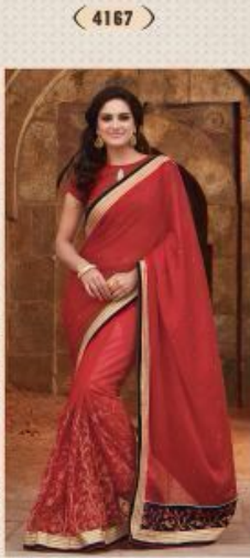
< 4167 >