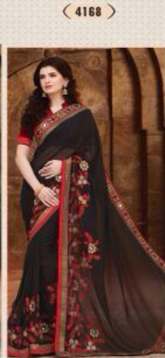
< 4168 >