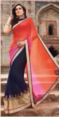
< 4163 >