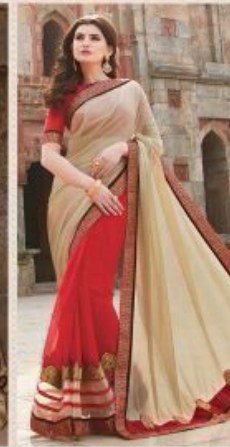
< 4172 >