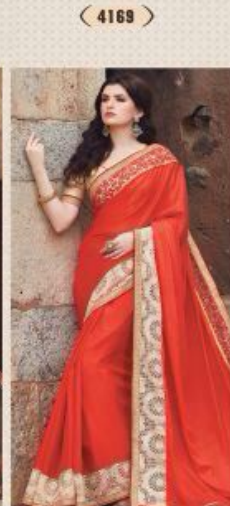
< 4169 >