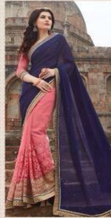
< 4170 >