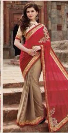
< 4165 >