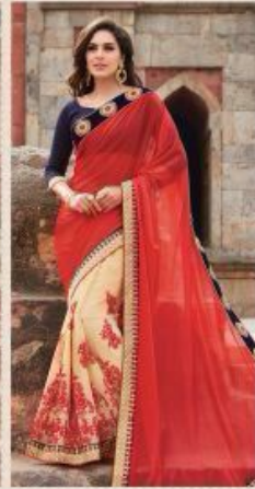
< 4164 >