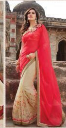
< 4173 >